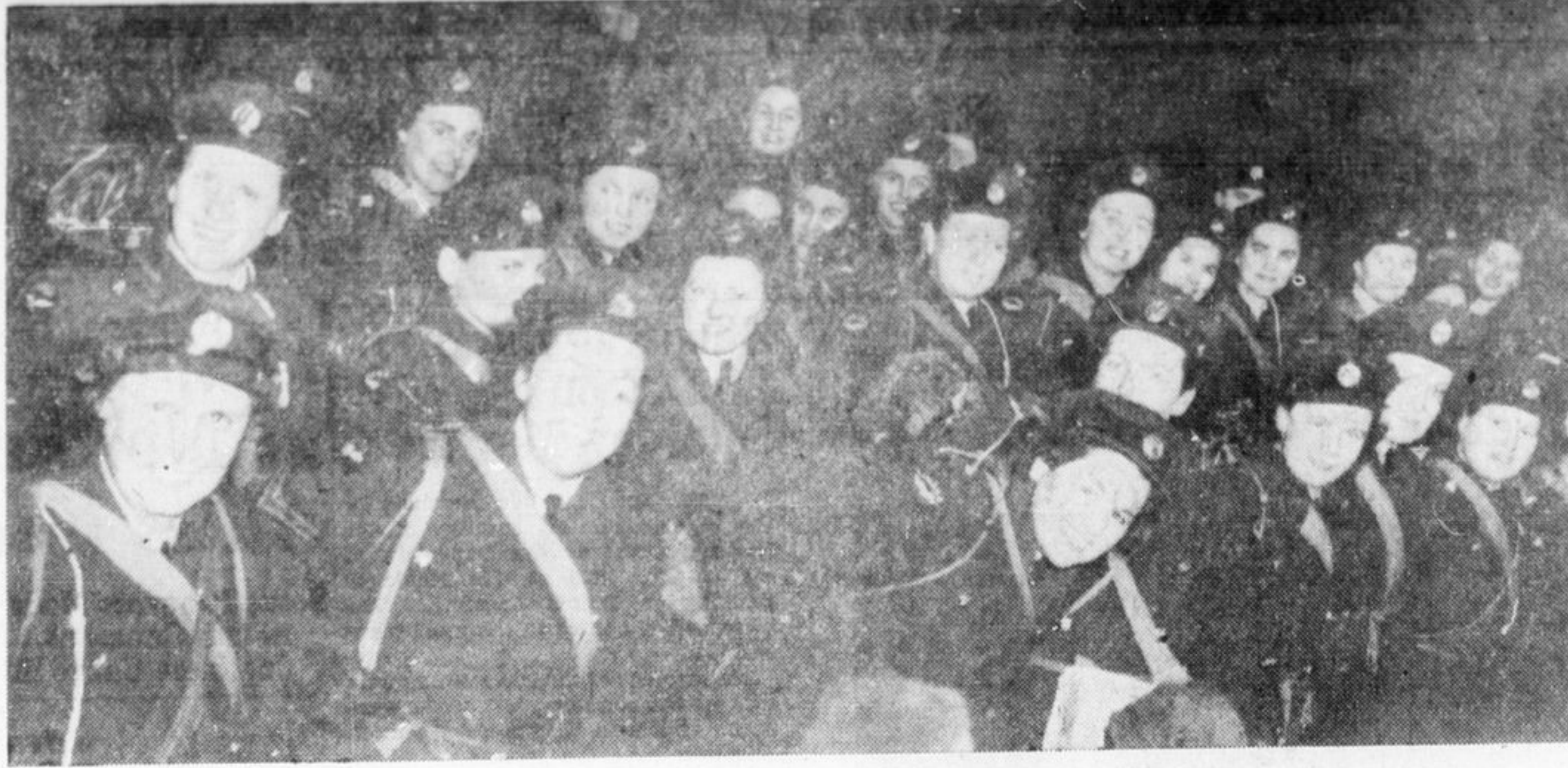
The largest contingent of Royal Canadian Air Force Women's Division to arrive in Britain, these smiling girls from the Dominion line up in a London railway station. From London these youthful Canadians went to the various stations of the Canadian Bomber Group which is making a large contribution to the steady aerial pounding of the Axis.