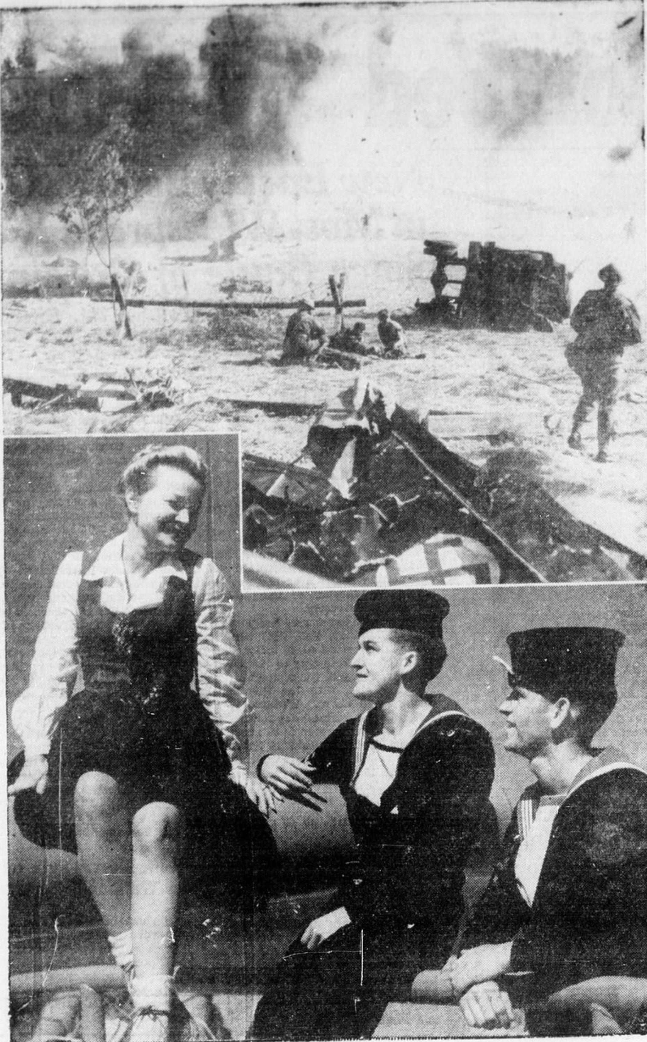
"Commandos Strike at Dawn," the vivid photoplay of Canada's Armed Forces produced by Columbia Pictures, portrays the hard-hitting Canadian Army so well that the film is rated as one of the best of this war. Based upon Norway's resentment of German aggression, and starring Paul Muni, the movie shows battle tactics of the Canadians, above, as they storm a "Nazi" airfield. Lower picture was an off-the-set camera-study of Greta Granstead, one of the starlets, chatting with A. Gerlock and Doug Allen, telegraphists aboard an auxiliary cruiser of the Royal Canadian Navy.