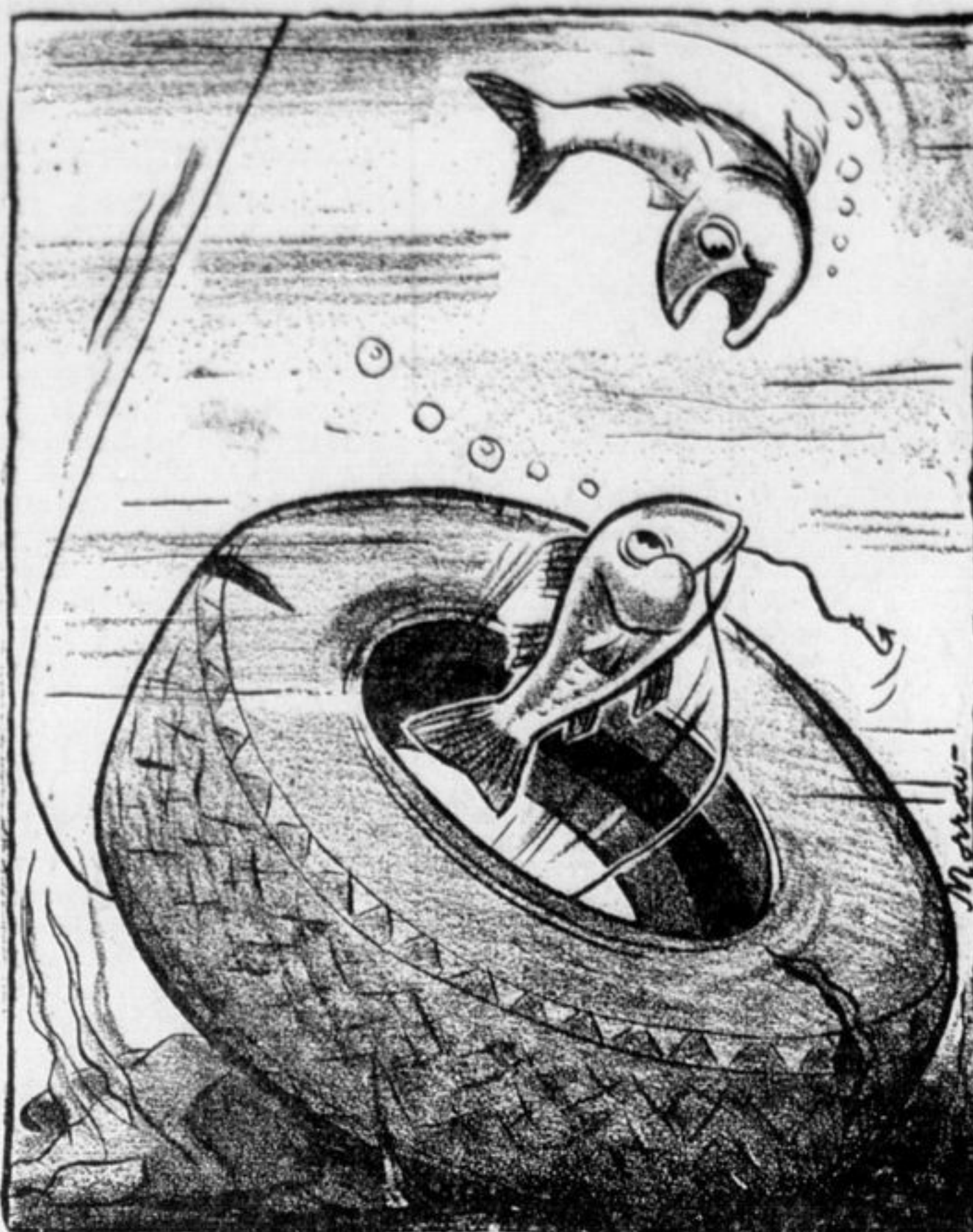
"I'm hooking the tire to help salvage scrap rubber"