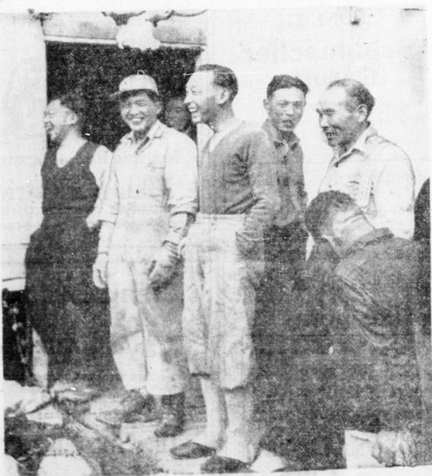
In the heart of the Canadian Rockies, far-removed from vital defence zones of the Pacific Coast, British Columbia Japanese have been grouped into large "enemy alien" camps. Under surveillance they perform road-building work on the proposed Edmonton to Vancouver highway. They live in camps set up by themselves; a group of Japs is here shown in front of a mess tent in one of the camps. Judging by the expressions on their faces they've suffered few hardships.