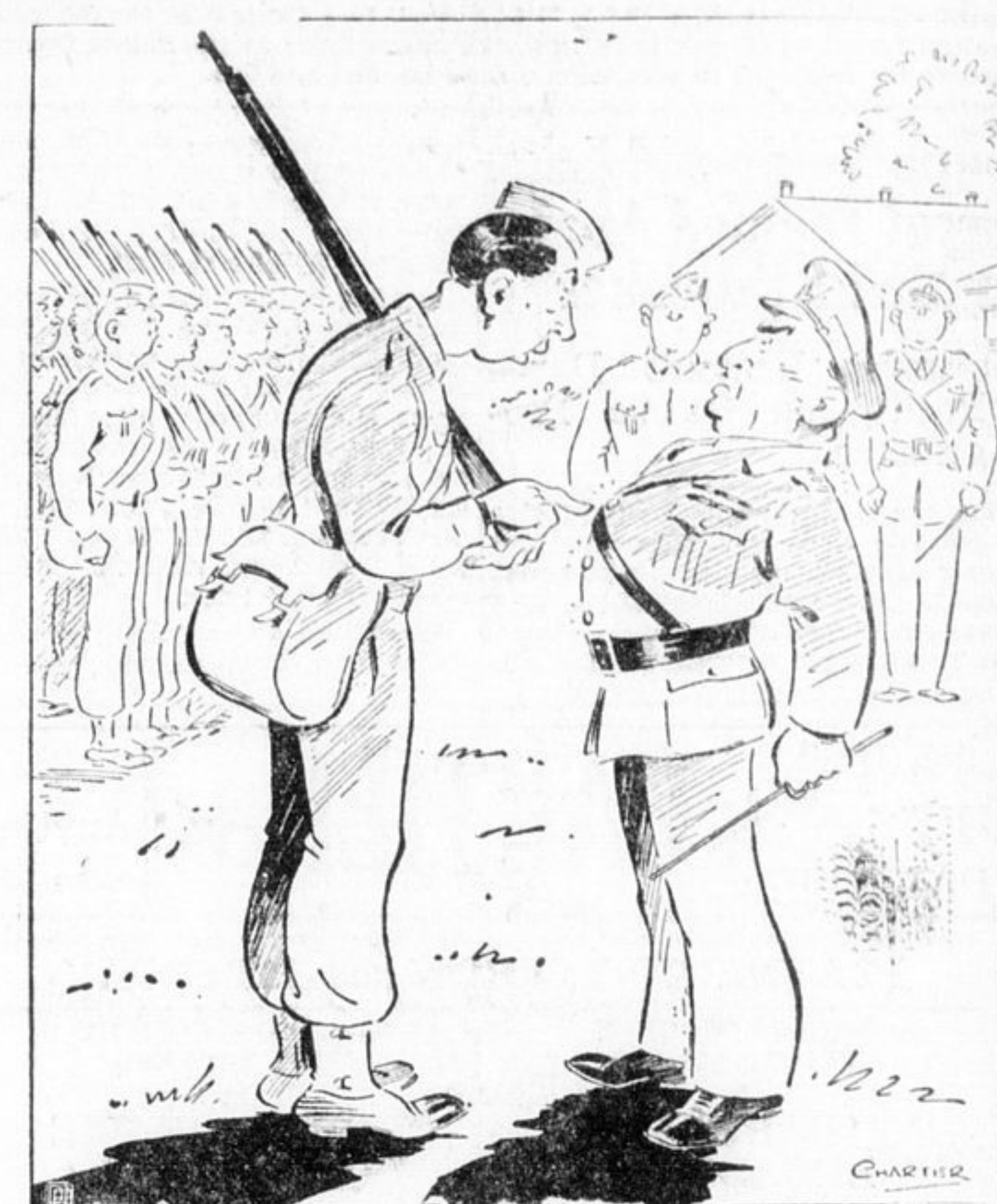
"Confidentially—How do you keep 'em so clean, Sir?"