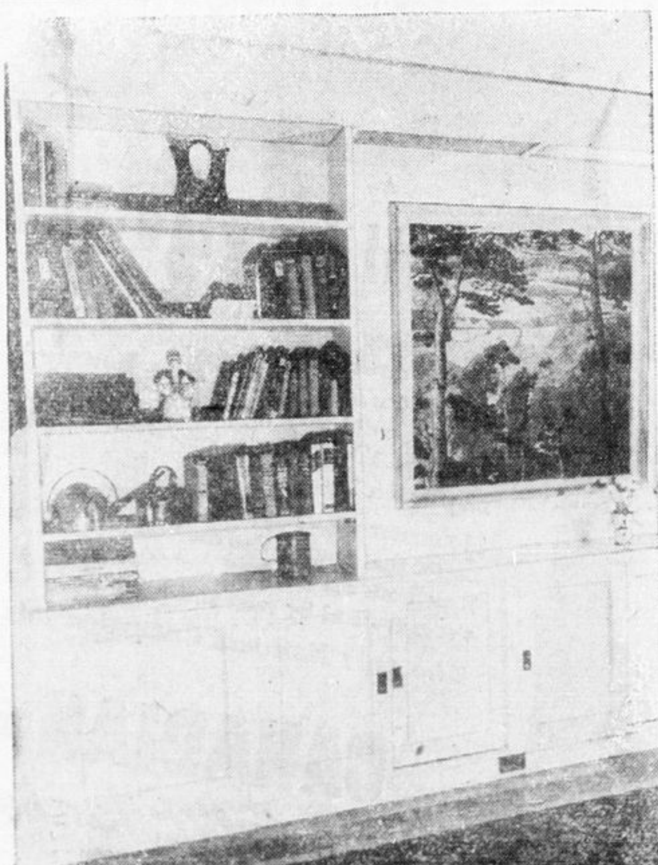
Extra closet space has been achieved in this small hallway by having sliding door sections underneath the book shelves.

Take good care of your terry towels, and they'll last a long time. Have the best quality and an adequate supply for family needs, emergencies, extra guests and possible late laundry. A leading towel manufacturer points out that by rotating your towels in use and laundering them properly, you are making your household goods last longer, thus doing your share toward victory. Keep them in trim piles with quilted adjustable bands.