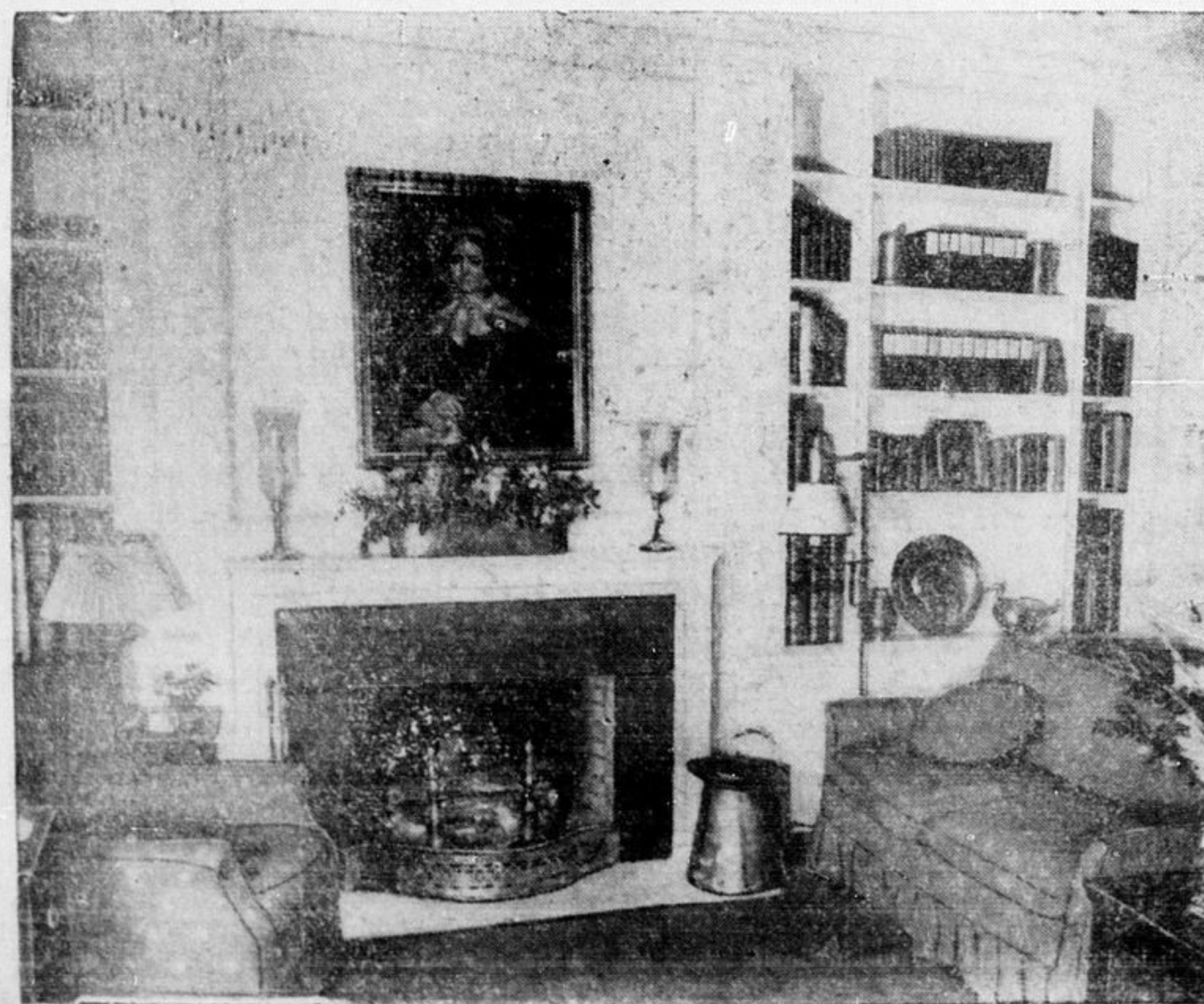
Built-in bookcases and deeply comfortable upholstered furniture in tomato reds give this small old brass and copper. This photograph was taken in the home of Mr. and Mrs. Howard Cullman.

A good example of one of those questions grasped out of thin air by the family's young hopeful and then tossed at an unsuspecting parent is the following: "Dad, why do you wind up a business when you want it to stop?"—Northern Tribune.