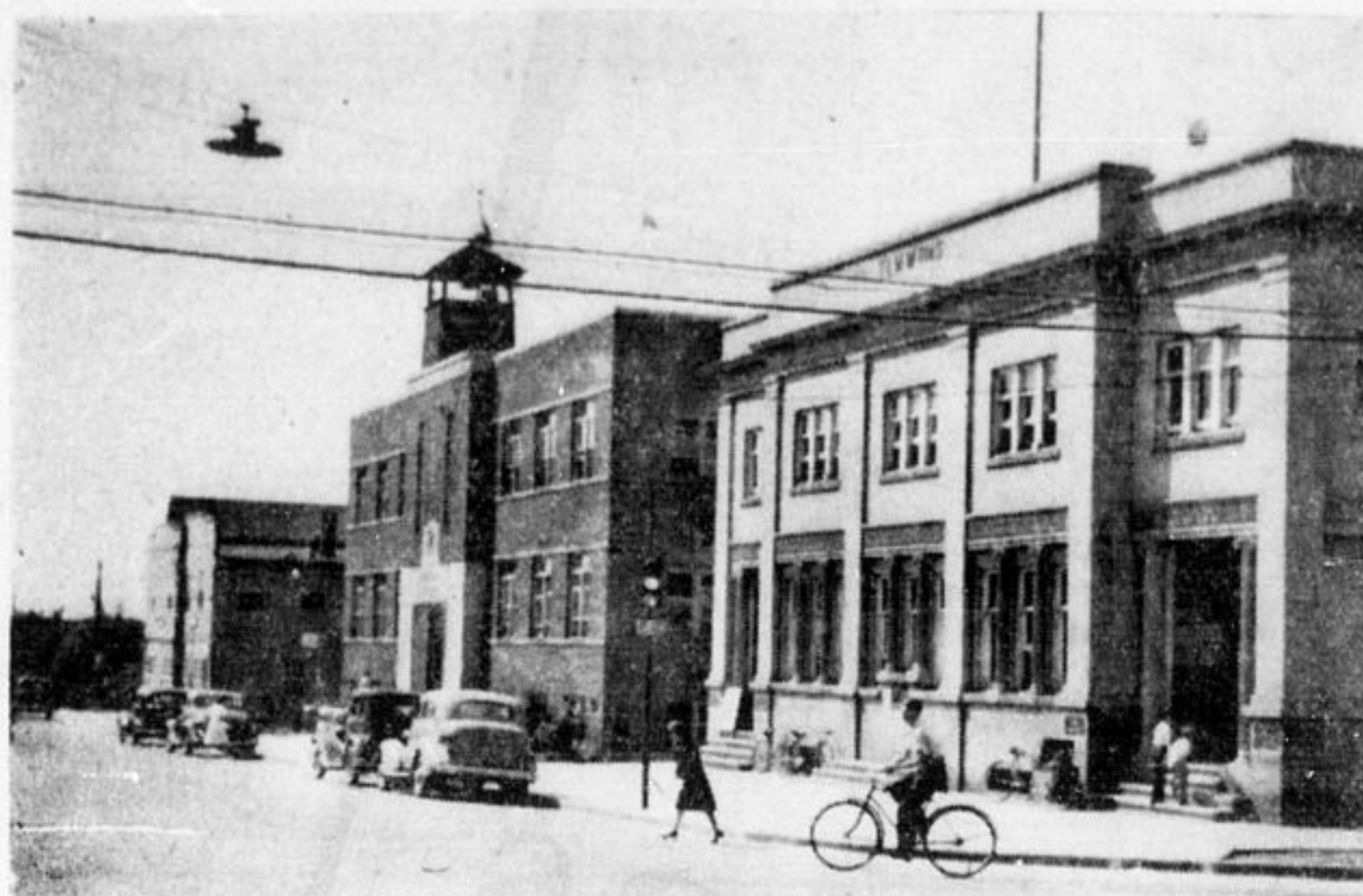
Municipal Building at Timmins

Here's a thumbnail sketch of Timmins at Christmas, 1941. Population of Timmins, according to the latest assessment figures—29,140. Increase of 510 over previous year. 700 business places. 5,000 dwellings. Assessment of land, $2,661,617. Assessment of buildings, $11,934,010. Total assessment, $14,645,627. Exempt—Land, $203,840; buildings, $3,757,841; buildings Home Improvement Plan, $529,110; total exempt, $4,486,791. Taxable property — $10,156,836. Increase over previous year, $488,758. Public school assessment—$7,296,175.