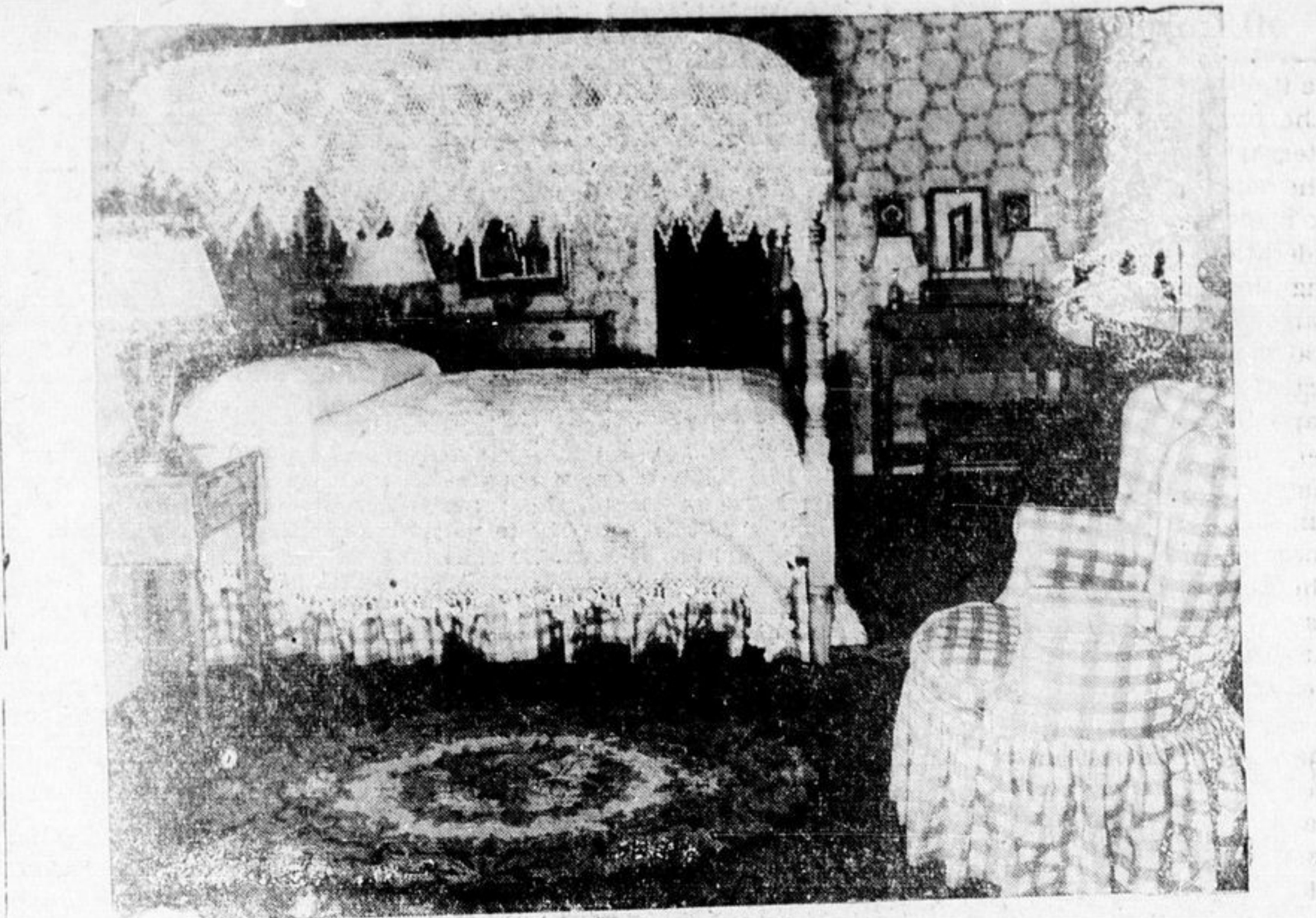
A forthright colonial air gives this bedroom its the flounce on the bed and the chair covering are charm. The maple furniture is set against blue red and white checked chintz.

IN BEDROOM FURNISHINGS, HOARD LIGHT, AIR AND SPACE. Don't Fill Your Bedrooms Too Full—Don't Be Dinky or Trinkety—Don't Forget to Put First Things First and Concentrate on a Good Bed, Good Chairs, and Good Light