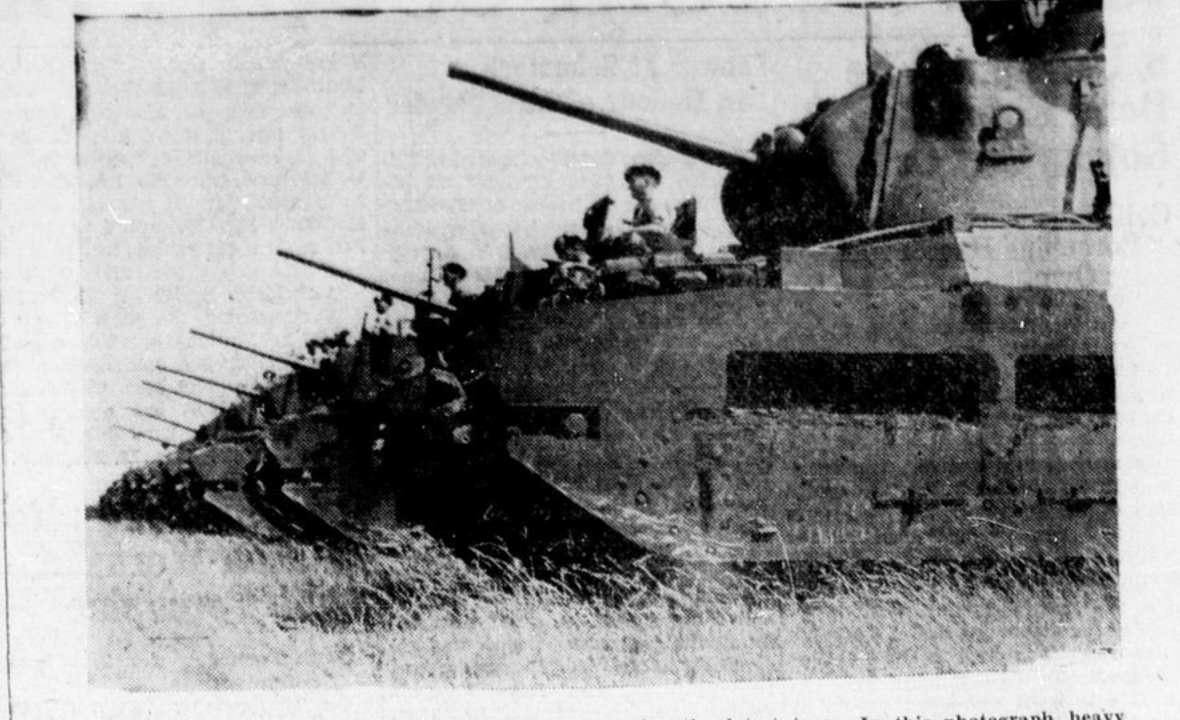
The Canadian Army Tank Brigade now in Britain have been given their first new tanks for further training. They have been among the first to receive the latest type. In this photograph heavy tanks of a French and English-speaking battalion from Quebec Province are lined up in mass formation.