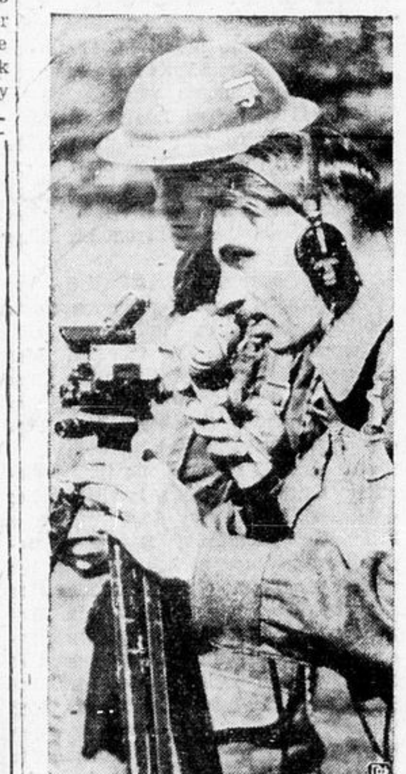
The soldier who appears in this photo is giving a play by play description of a football match is the Gunnery Position Officer of a Royal Canadian Artillery howitzer battery. His instructions are broadcast over a loudspeaker system to each gun and the crews aim their weapons accordingly. The scene is in England, during artillery exercises.