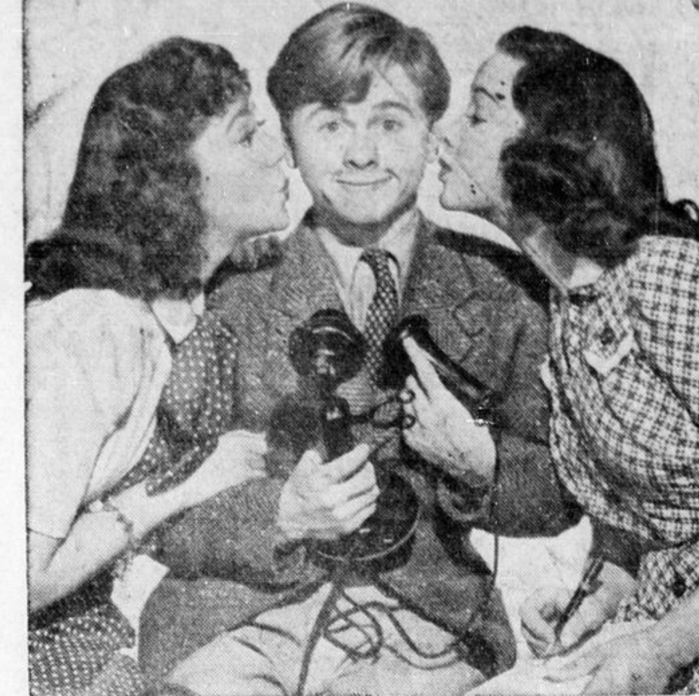
Mickey Rooney get a double-dose of girl trouble in the latest Hardy Family laugh hit "Andy Hardy's Private Secretary," at the Palace theatre Monday and Tuesday, July 28th and 29th. At his left is Ann Rutherford playing her familiar role of Andy's high school sweetheart, while on the right is Kathryn Grayson, making her screen debut as his "private secretary."