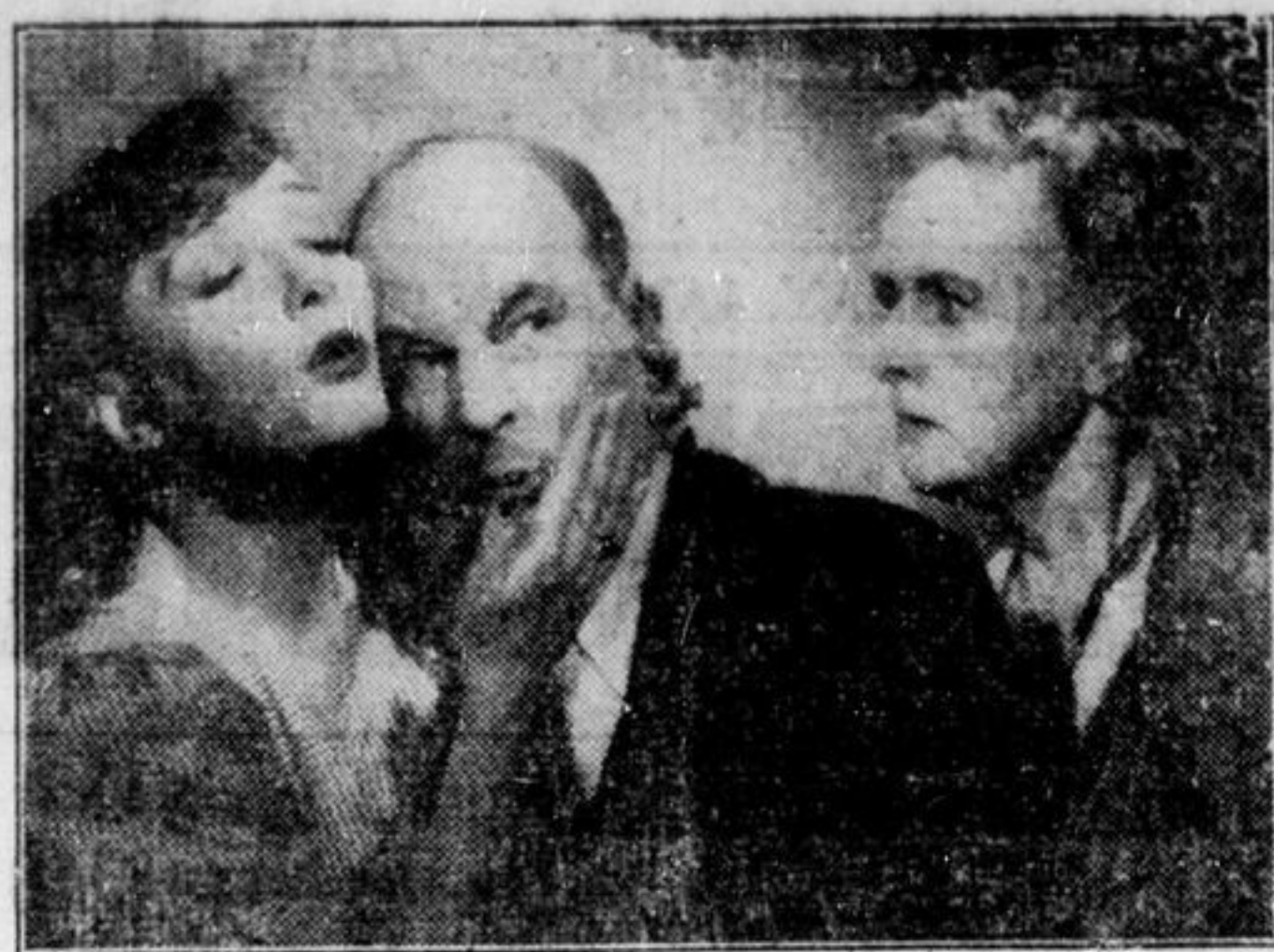
Lupe Velez as the fiery Carmelita and Leon Errol as Uncle Matt and Lord Epping carry on with further escapades in marriage and masquerade, to the distress of Elizabeth Risdon, featured as Uncle Matt's wife. It's all part of the hilarious fun in "Mexican Spitfire Out West," in which Lupe goes to Reno to divorce her husband, played by Donald Woods. At the Cartier Theatre Friday and Saturday, Jan. 10 and 11.