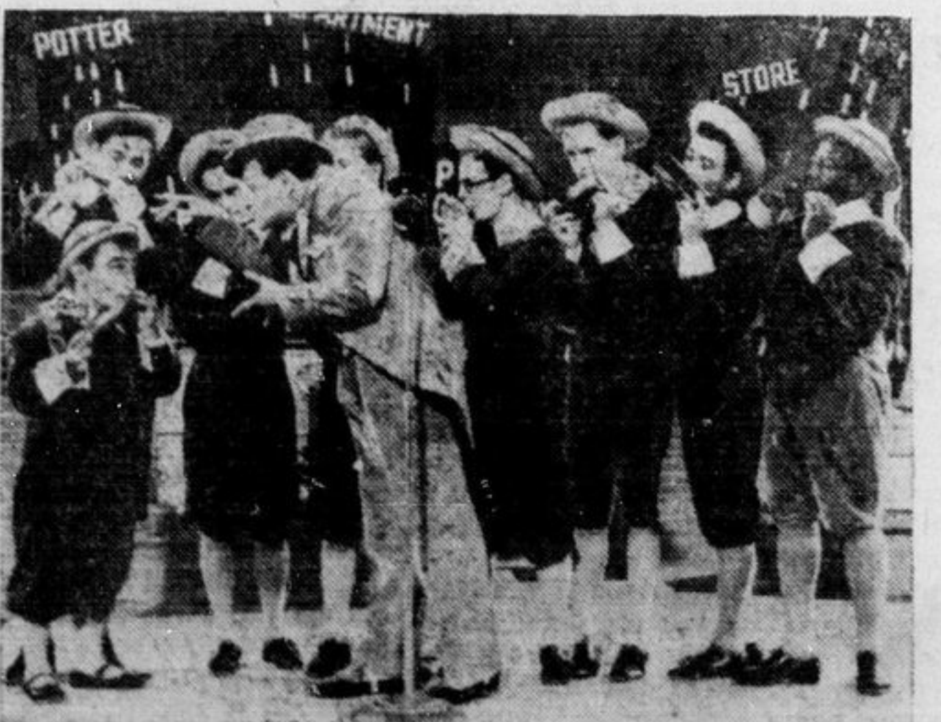
Borrah Minevitch and his Harmonica Rascals as they appear in the Republic comedy with music, "Hit Parade of 1941," at the Palace Theatre, Friday, Friday midnight, and Saturday, Jan. 10th and 11th.