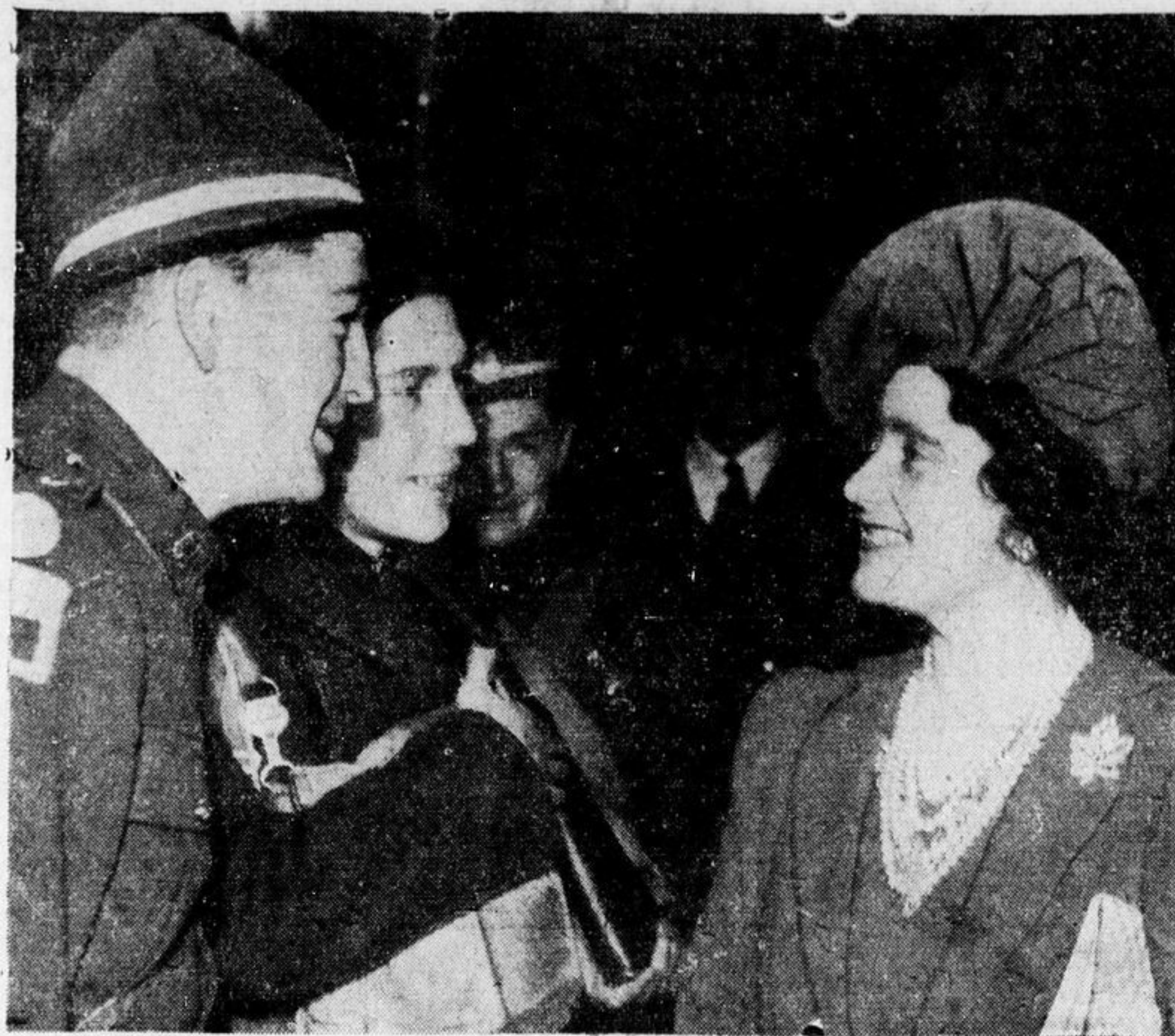
In her unwearying round of visits to the troops in Britain, her majesty displays a special kindness for the men from the dominions overseas. Wherever she goes, pictures reveal that she wears the maple leaf emblem which has been a favourite ornament ever since she came to Canada with the King. She is shown here as she chatted with some of the stalwart fighters from New Zealand during a recent inspection tour.