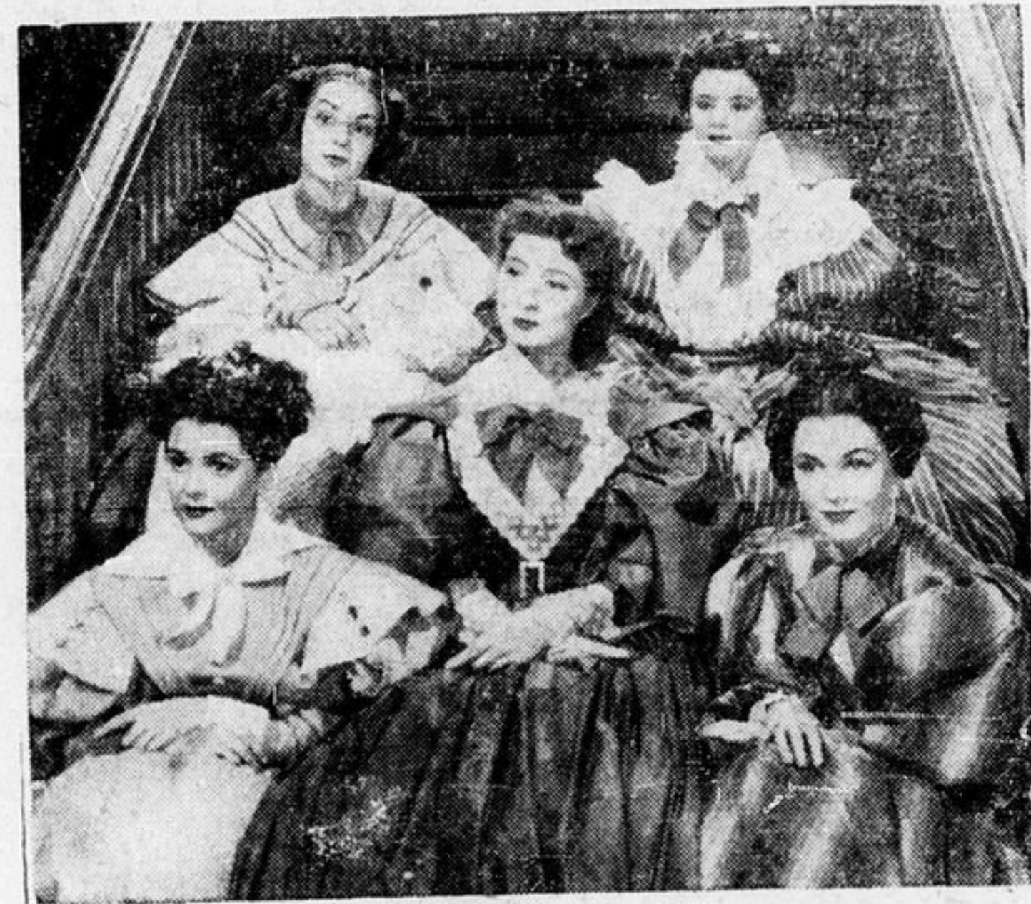
The five Bennet sisters around whom the story of "Pride and Prejudice" revolves. With Greer Garson, co-starred in the picture with Laurence Olivier, seated in the center, the group around her comprise Ann Rutherford, Marsha Hunt, Heather Angel and Maureen O'Sullivan. These are the five marriageable sisters in search of a husband in the filmization of Jane Austen's romantic comedy, which will be shown at the Palace theatre on Friday, Friday midnight and Saturday, Nov. 8th and 9th.

Departing from the time-worn western plots, "Wagon Train" rolls across a panorama of high adventure, the menace of Indian ambush and the fascination of trail-blazing romance. "Wagon Train" is showing at the Cartier on Friday and Saturday of this week, Nov. 8th and 9th. Depicting the dangerous trek of the