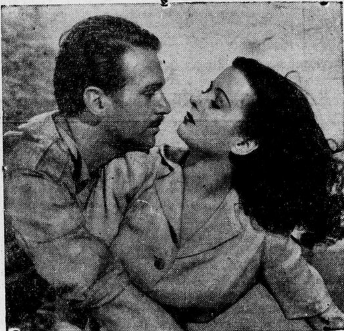
A scene with Douglas Fairbanks, Jr. and Joan Bennett from the gripping screen drama "Green Hell" playing at the Palace Theatre Friday, Friday Midnight and Saturday of this week.