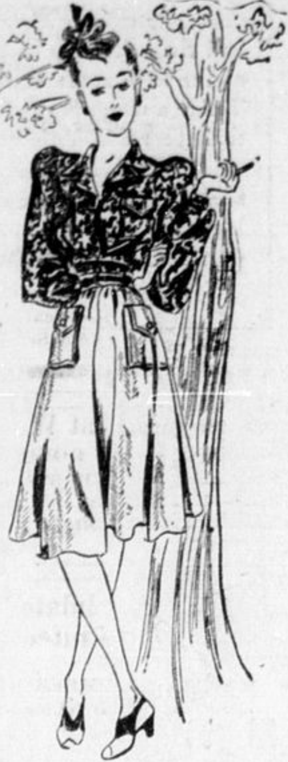
Blouse of Printed Tie Silk

Spectator sports fashions offer a wide field and everything from slacks to a crepe ensemble seems to be acceptable. Here is a spectator sports outfit that is right for it manages to be smart and elegant while it retains a casual note.