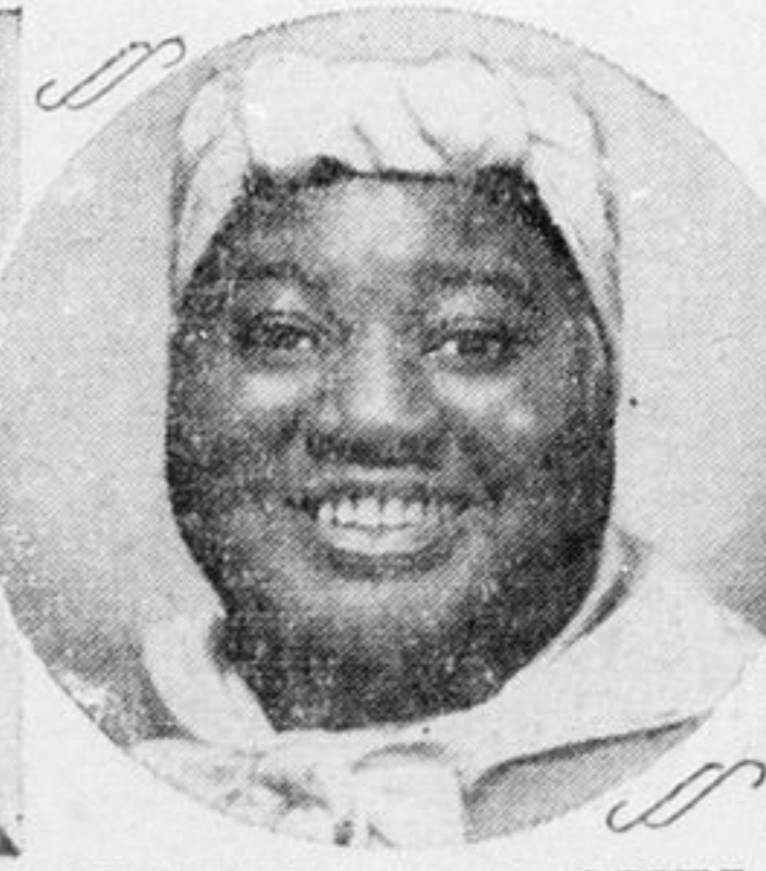
HATTIE McDANIEL as Mammy