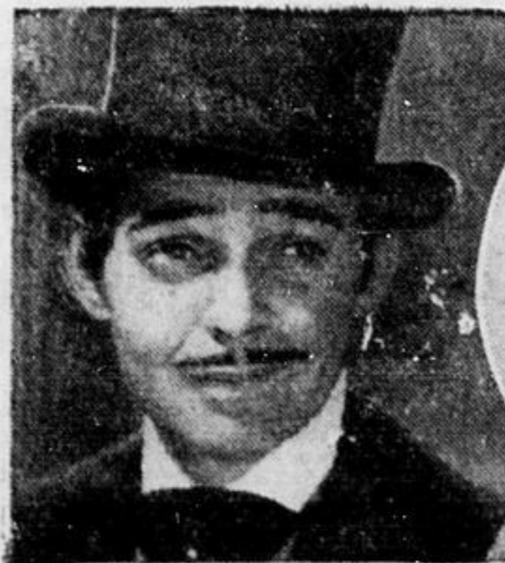
CLARK GABLE as Rhett Butler