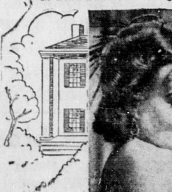
ONA MUNSON as Belle Watling