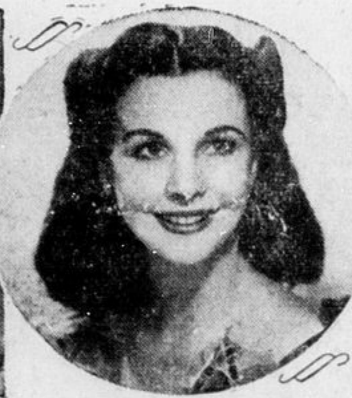
VIVIEN LEIGH as Scarlett O'Hara