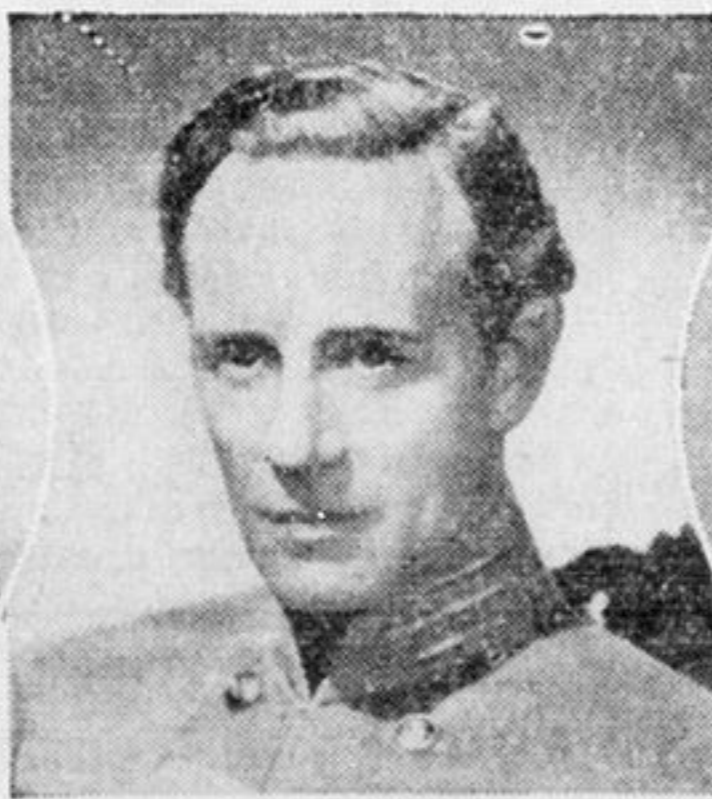
LESLIE HOWARD as Ashley Wilkes