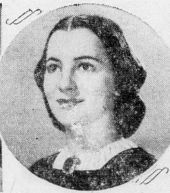
OLIVIA de HAVILLAND as Melanie Hamilton