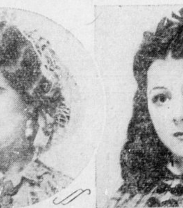
ANN RUTHERFORD as Carreen O'Hara