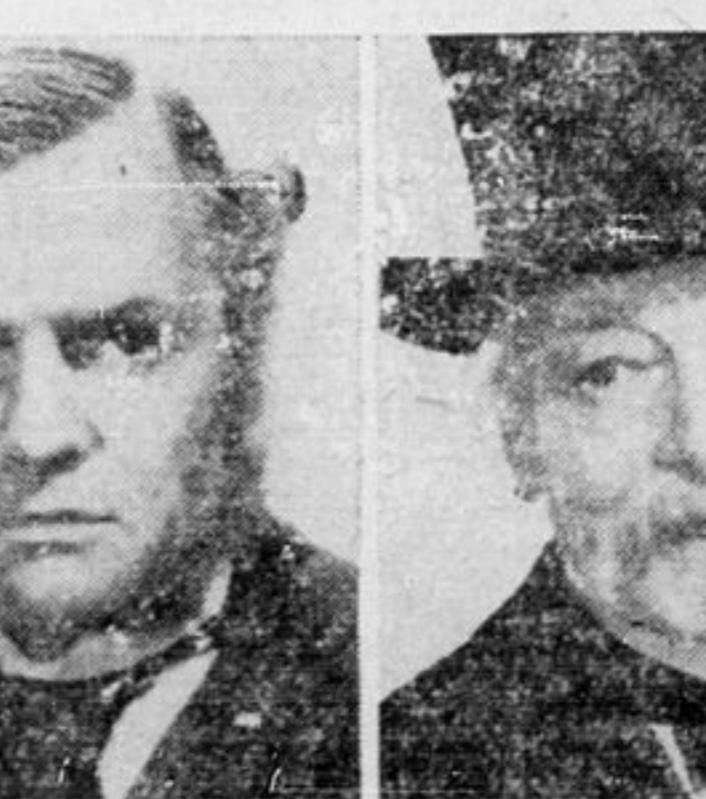
HARRY DAVENPORT as Doctor Meade