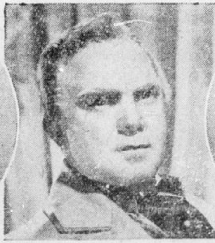
THOMAS MITCHELL as Gerald O'Hara