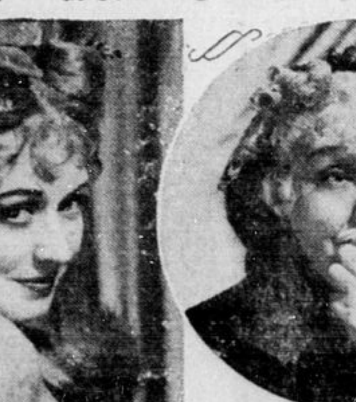
LAURA HOPE CREWS as Aunt "Pittypat"