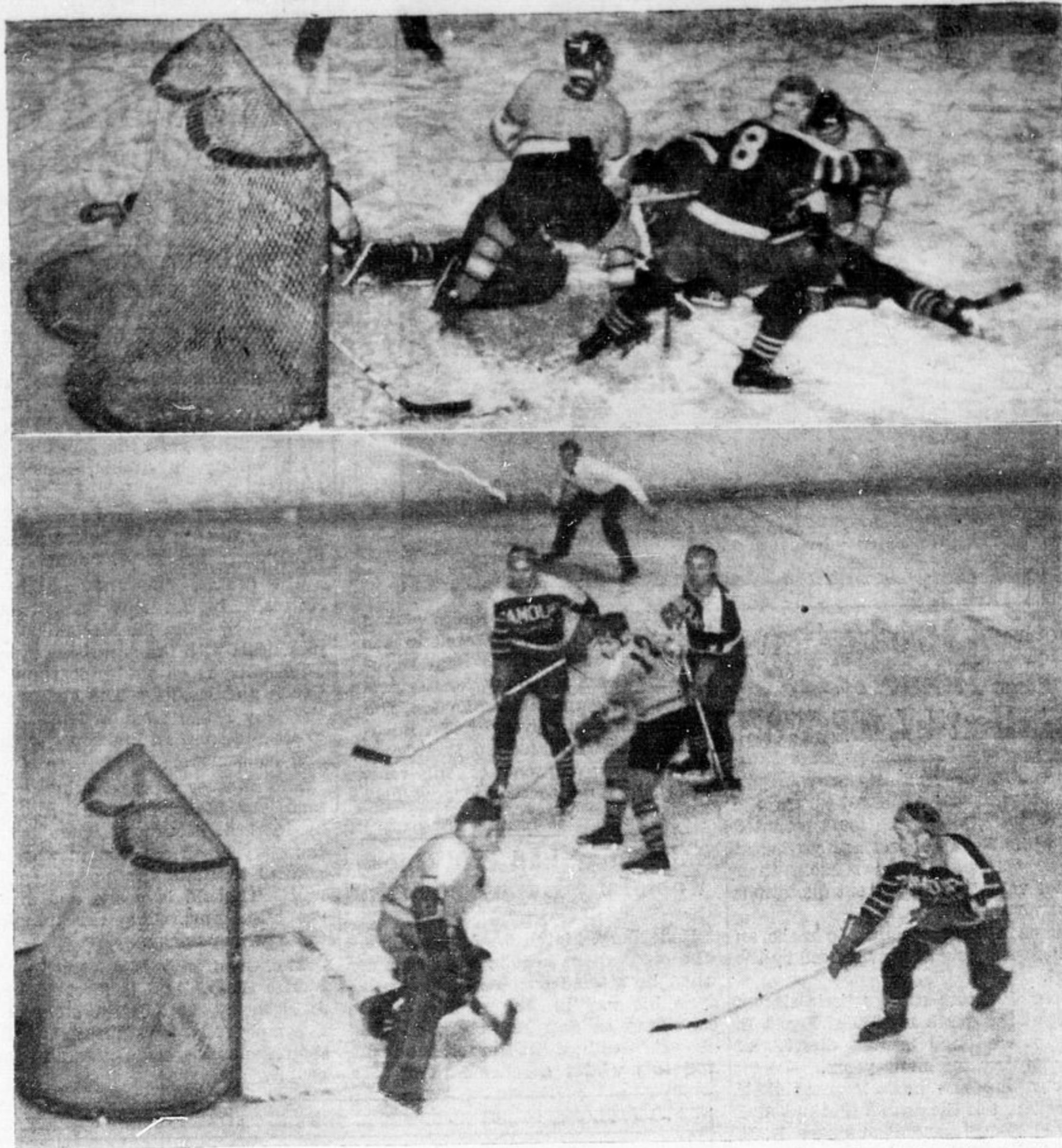
ACTION FAST IN LAST NIGHT'S GAME