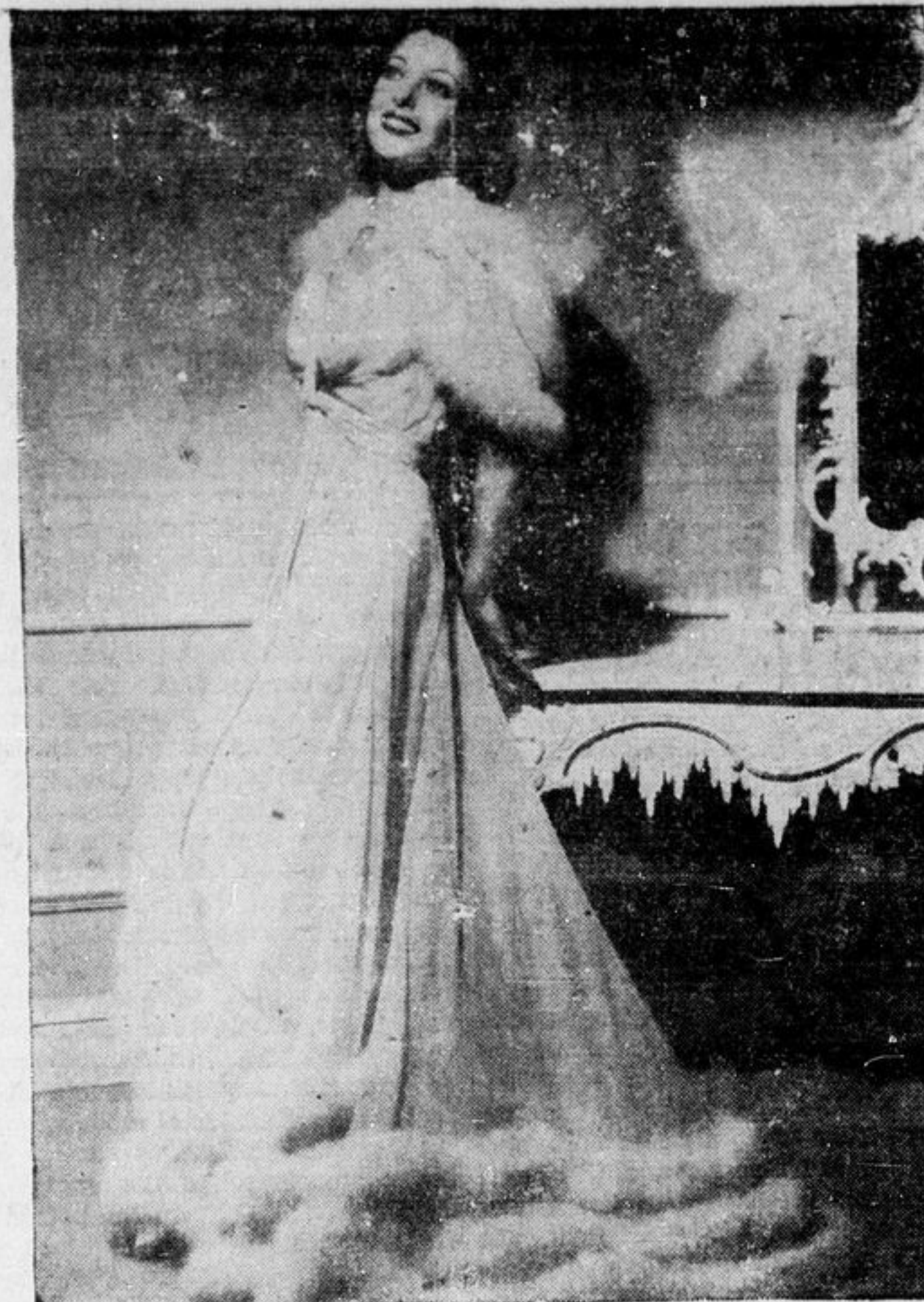
Another "luxury" treat for oneself might be a shimmering negligee such as LORETTA YOUNG is wearing.

Famous Beauty Authority Suggests That Some Gifts to Yourself Are Really Gifts to All Around You. Suggestion for a Nonsense Fund to Meet the Needs.