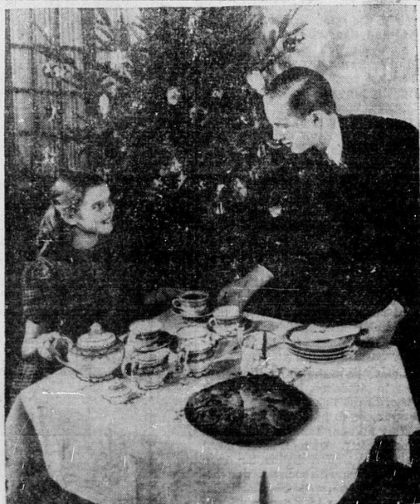
A card table set for tea beneath the Christmas tree is a simple popular way to entertain the younger generation.

CHRISTMAS IN THE KITCHEN — If you have a big kitchen, hang garlands of green from the ceiling and spread the big work table with a green and white checked gingham cloth; make a centerpiece of evergreens and pine cones in a wooden bowl or basket. Set the table with pewter plates and mugs. What a place for a baked bean supper or a Mexican chili party one