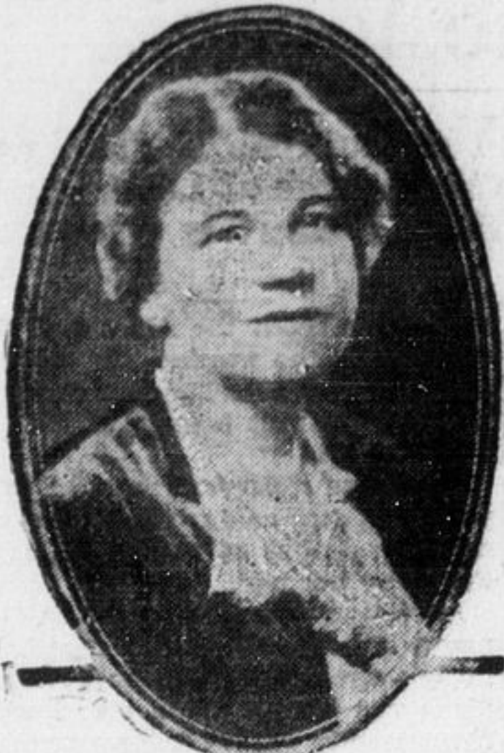
By EDITH M. BARBER

Divide the butter into two portions. Put one portion in a small saucepan with the egg yolks and lemon juice. Hold saucepan over hot (not boiling) water, stirring constantly until butter melts. Add remaining butter and stir until thick. Serve at once. (Released by The Bell Syndicate, Inc.)