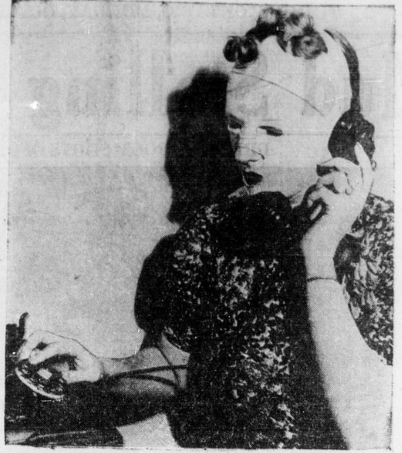
Our modern beauty ties up her face in a beauty lift masque and proceeds with her market ordering!