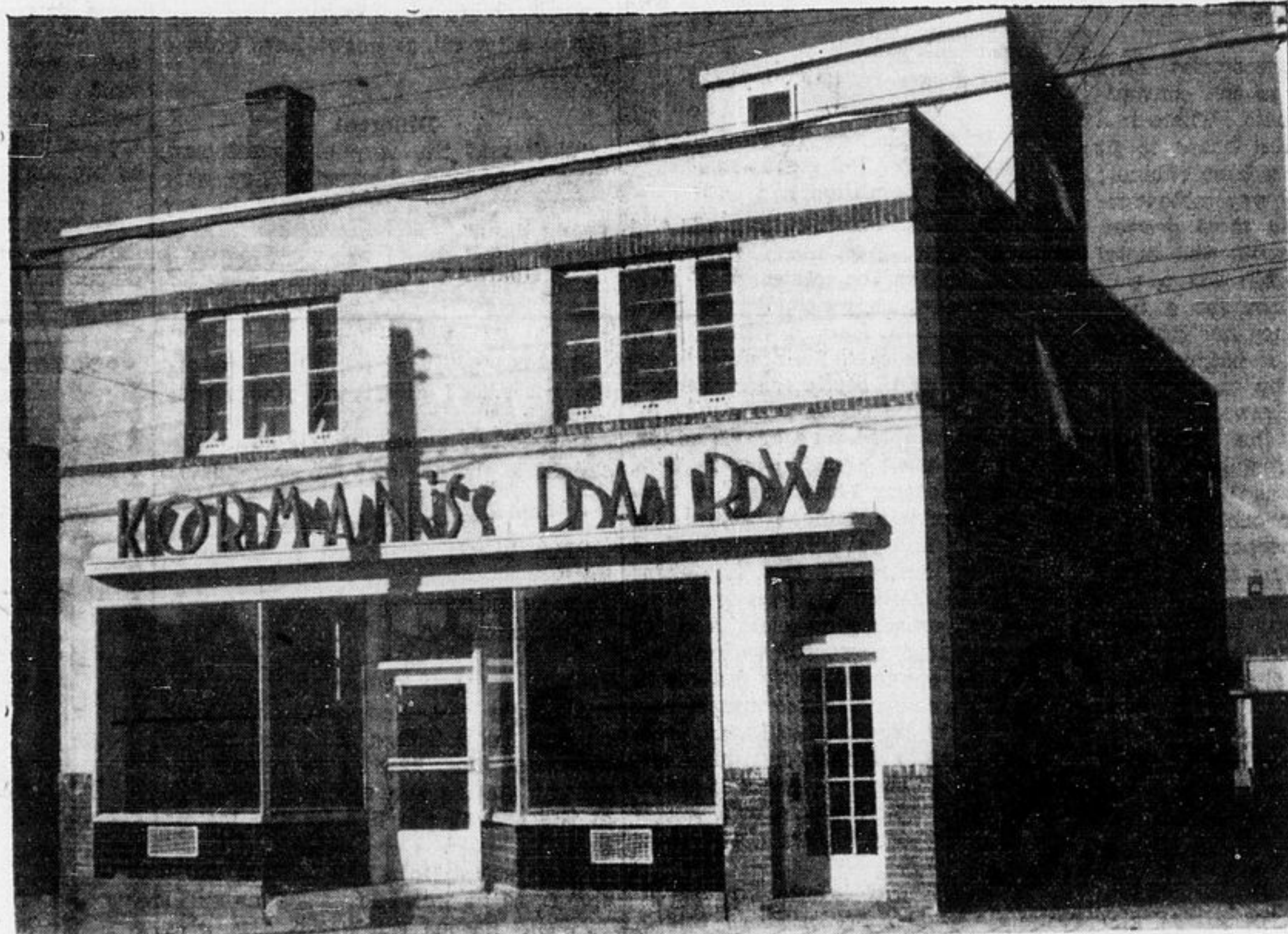
The Korman's Dairy plant pictured here is the most recent addition to permanent buildings in the north. A two-storey structure of most modern design, it houses the finest dairy equipment available, to give the people of this district pure, pasteurized milk.

Visit This Modern, New Sanitary Plant To-day