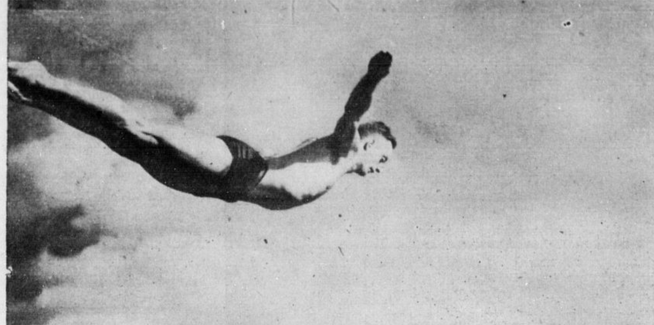
AS MUCH AT HOME IN AQUA PURA AS ON TERRA FIRMA

The First Division's opening card—Aberdeen vs Celtic. Albion Rovers vs Ayr United. Alloa vs St. Johnstone. Clyde vs Falkirk. Cowdenbeath vs Third Lanark. Hamilton Academicals vs Arbroath. Heart vs Partick Thistle. Kilmarnock vs Motherwell. Queen of South vs Hibernian. Rangers vs St. Mirren.