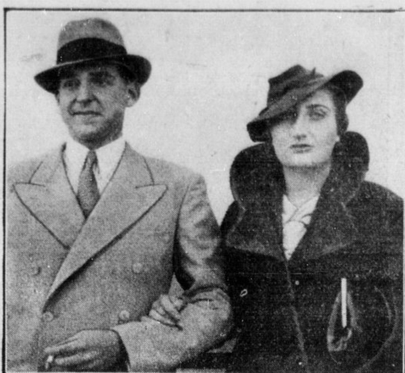
Bombshell news from Spain July 26 was a report that Gen. Franco had dispatched a messenger to ask former King Alfonso XIII, LEFT, to return to the throne. Persistent statements from Italy have claimed such a move would never be countenanced. Mussolini has been pictured as favouring Alfonso's son, Prince Don Juan of Bourbon, here with his wife, the Former Maria de la Mercedes de Bourbon-Siciles, RIGHT, for the job. But to the announcement was added another which said Il Duce will likely visit Spain next spring. Since their exile, the Italian government has given the former royal family asylum.

able to carry on with the arduous duties of his office. The fact that the Prime Minister refused to accept his resignation is an indication of his value.