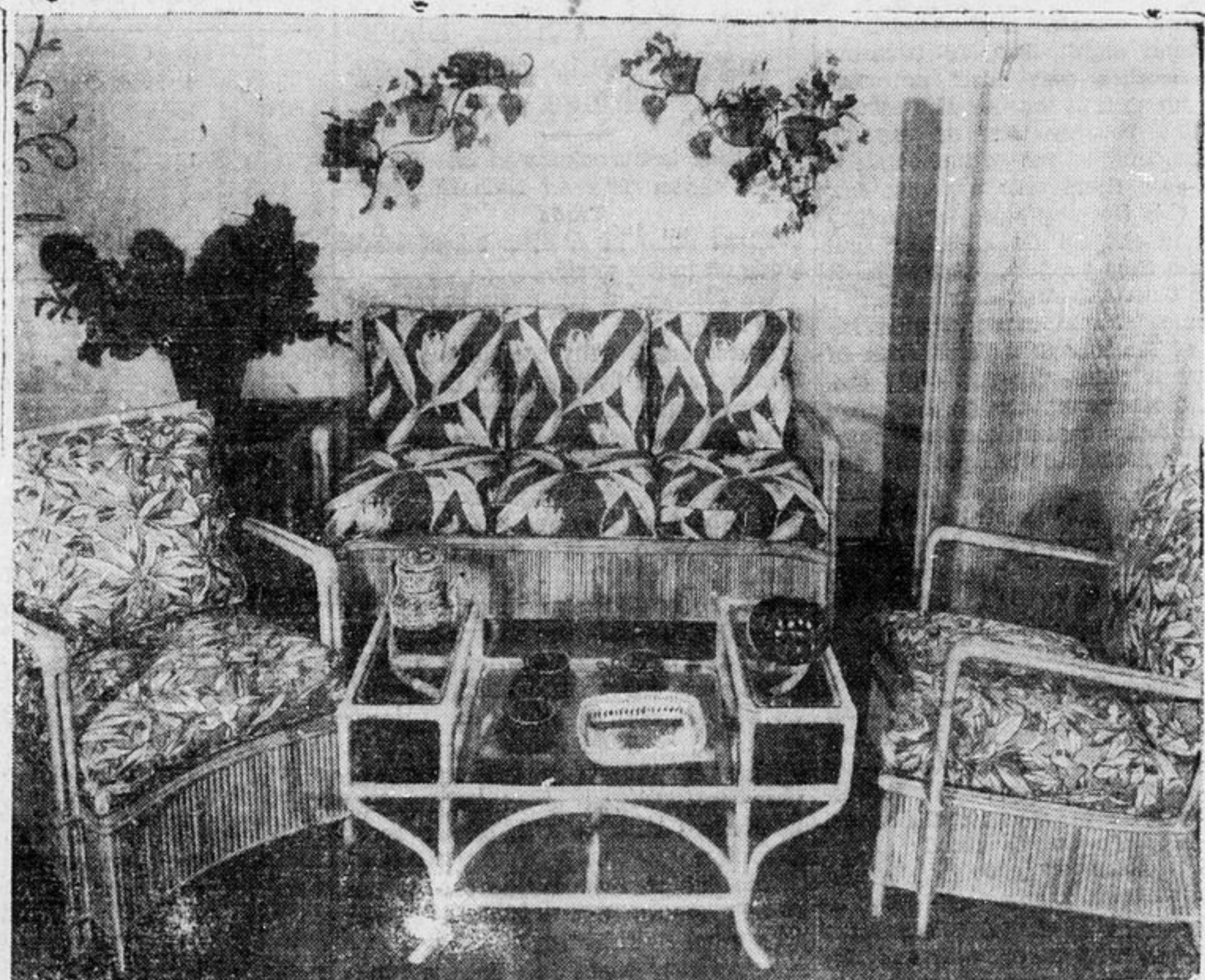
Rattan and bamboo are being used this year in a pickled pine finish that is very attractive. Cushions are in subtle all-over patterns and ensembled rather than matched exactly

a fresh coat of paint or some sort of refinishing for the next season. Cushions, even the most determinedly weather proofed ones can only stand so much; so whenever possible it's a good idea to carry them in a storm. The advantage of weather-proofed cu-