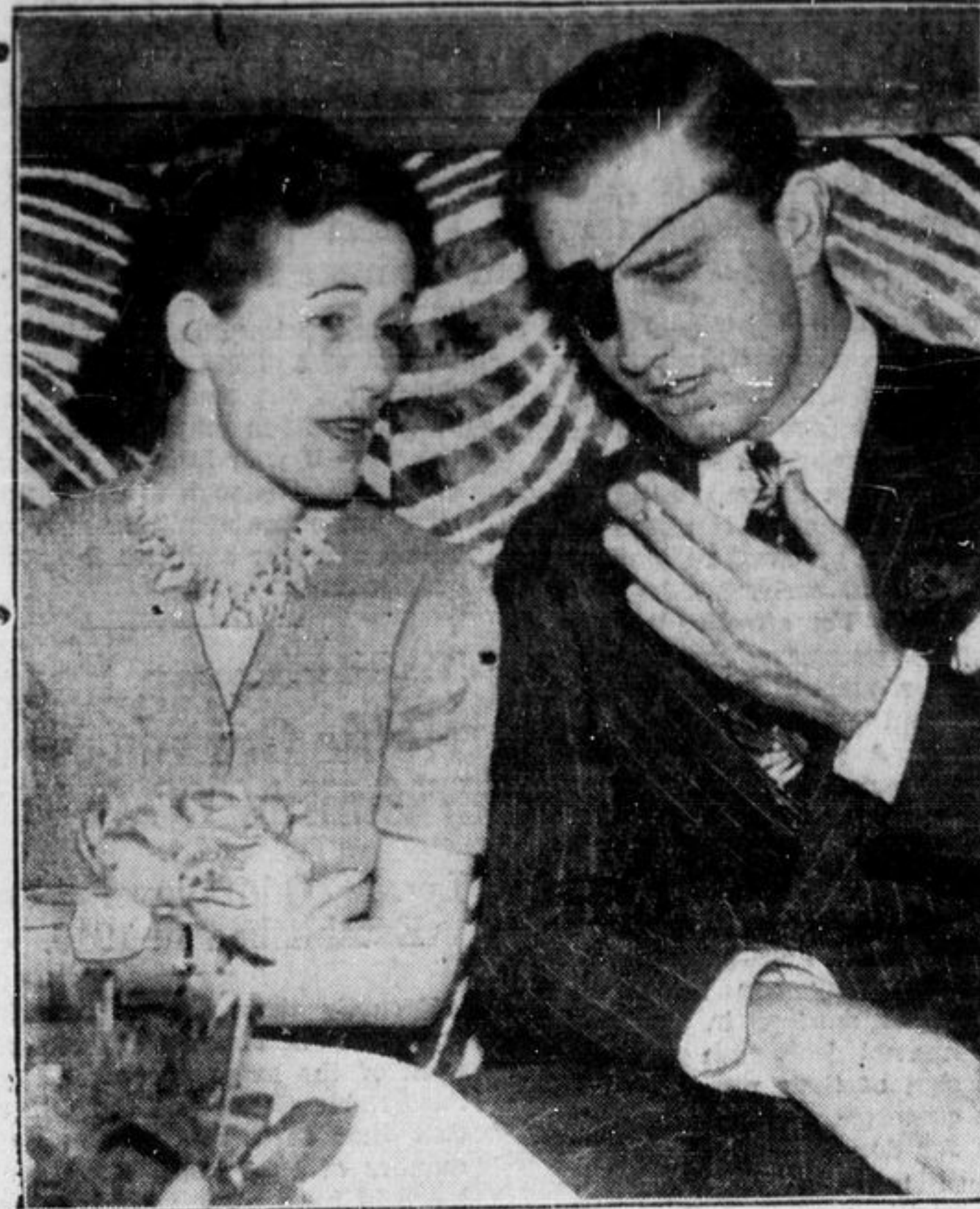
An angry bee at the Hot Dog Picnic for the King and Queen caused the only casualty of the day. It was Franklin D. Roosevelt, Jr., the president's son, who came out loser in the encounter...