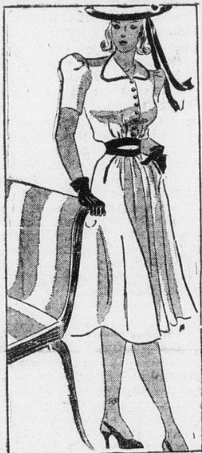
Peasant Silhouette By VERA WINSTON

THE PEASANT dress silhouette is too becoming to too many figures to be neglected by the stylists. Little frocks of this type sketched are plentiful. This model in natural color spun rayon has dark green collar piping and green-trimmed buttons. The belt of dark green leather buckles in back and controls the front fullness of the skirt. Slit pockets are lined in green.