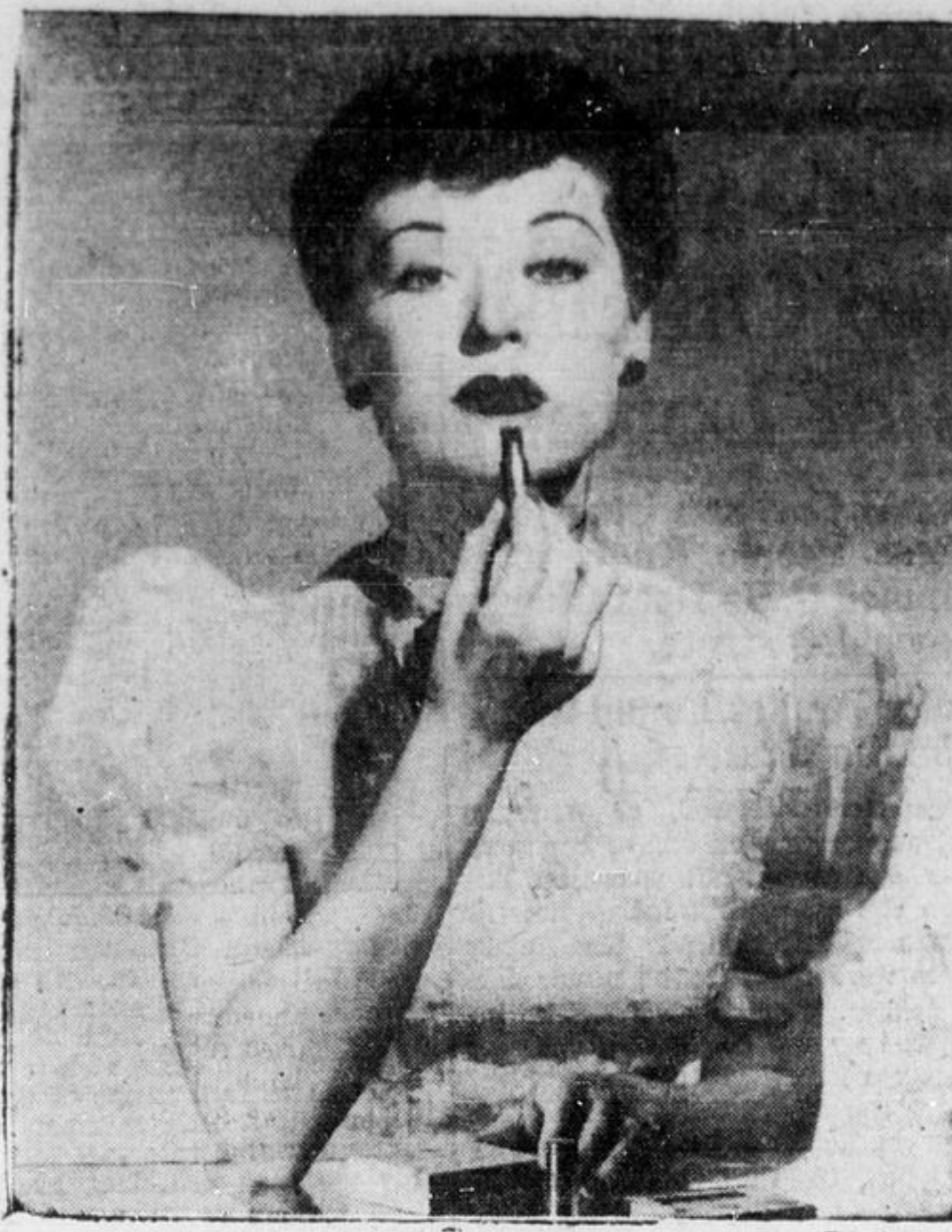
Charming in her freshness this young lady is putting a becoming lip colour on as a final touch to grooming.

Fresh As a Daisy, Delicate As a Rosebud, Fashion Dictates