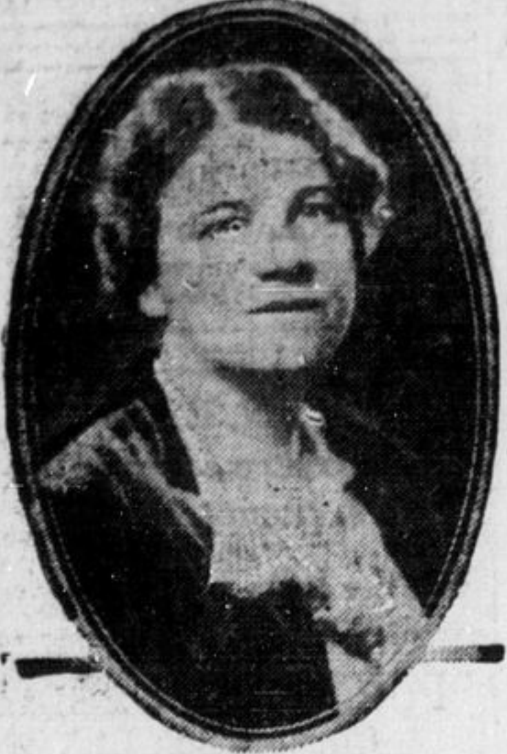
By EDITH M. BARBER

When you market over the week-end you will probably find that young duckling and broiling and frying chickens furnish the best bargains among poultry. There is the same good variety at the fish market. Lobsters are at the peak of their season. Strawberries