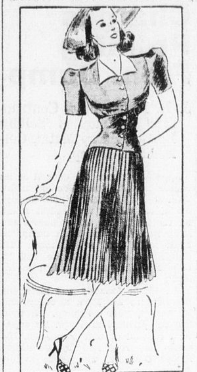
For town wear By VERA WINSTON

THERE'S no doubt about the cool look of navy blue, especially when that shade is set off by white, as in this dress for town wear. It's sheer crepe with detachable crepe collar. The midriff section accentuates the curve of the waist, emphasizing just and hipline. The skirt is knifepleated all around. White bone buttons.