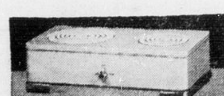
HOTPLATE—Ideal for late supper snacks, light summer meals, warming baby's bottle. Quick, instant heat for any purpose.