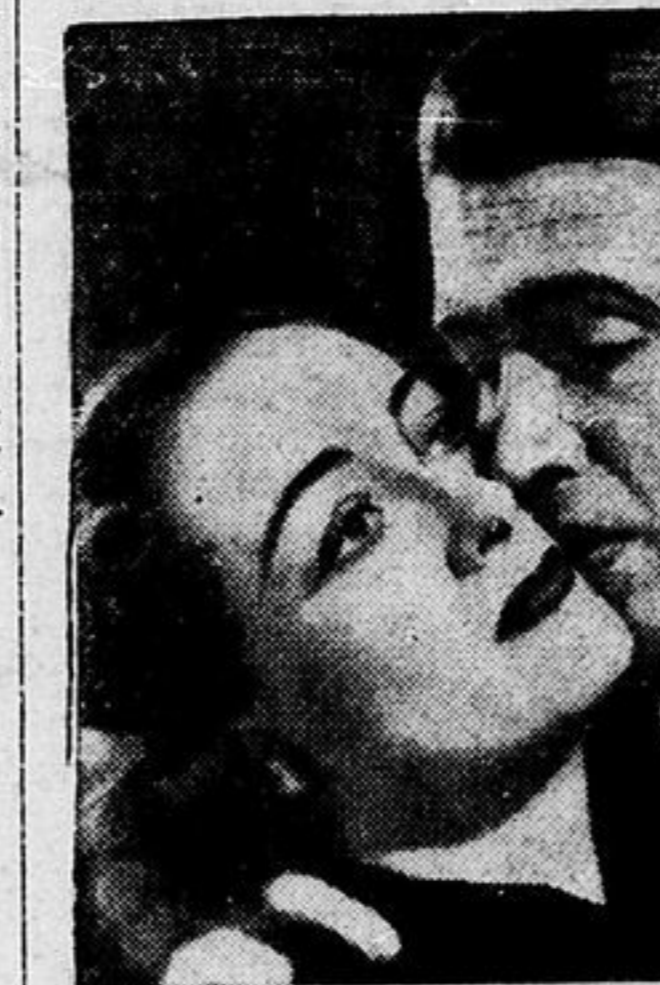
Joan Crawford and James Stewart in "The Ice Follies of 1939"

In addition to the outstanding picture on the screen, there is a happy and peppy revue on the stage. The stage offering is "Fuzz-a-Poppin'" Re-