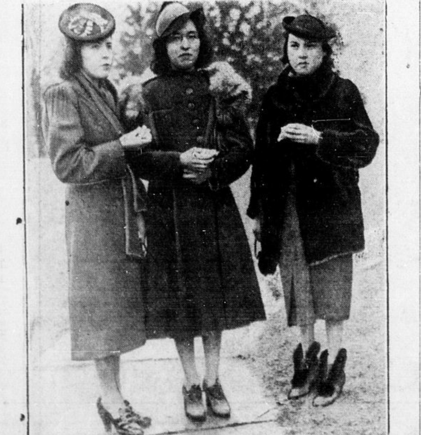
These three Inuit girls live on the Inuit reservation near Brantford, Ont. Because years ago, famous Chief Brant sold some lands, the government each year pays $5 to every man, woman and child on the reserve. The girls were there to collect when the line-up started at the council house.