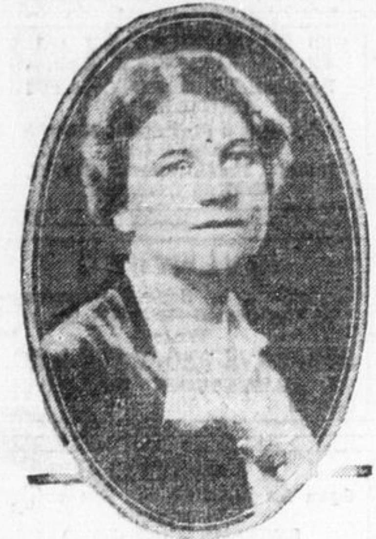
By EDITH M. BARBER

than seven or eight minutes. Over-cooking noodles makes them tough. After the noodles have been drained, they may be merely mixed with melted butter, salt, pepper and a little onion juice if you like, before being packed into a well greased mold. For a lighter, more delicate ring, eggs and milk which when baked form a custard, may be combined with the noodles.