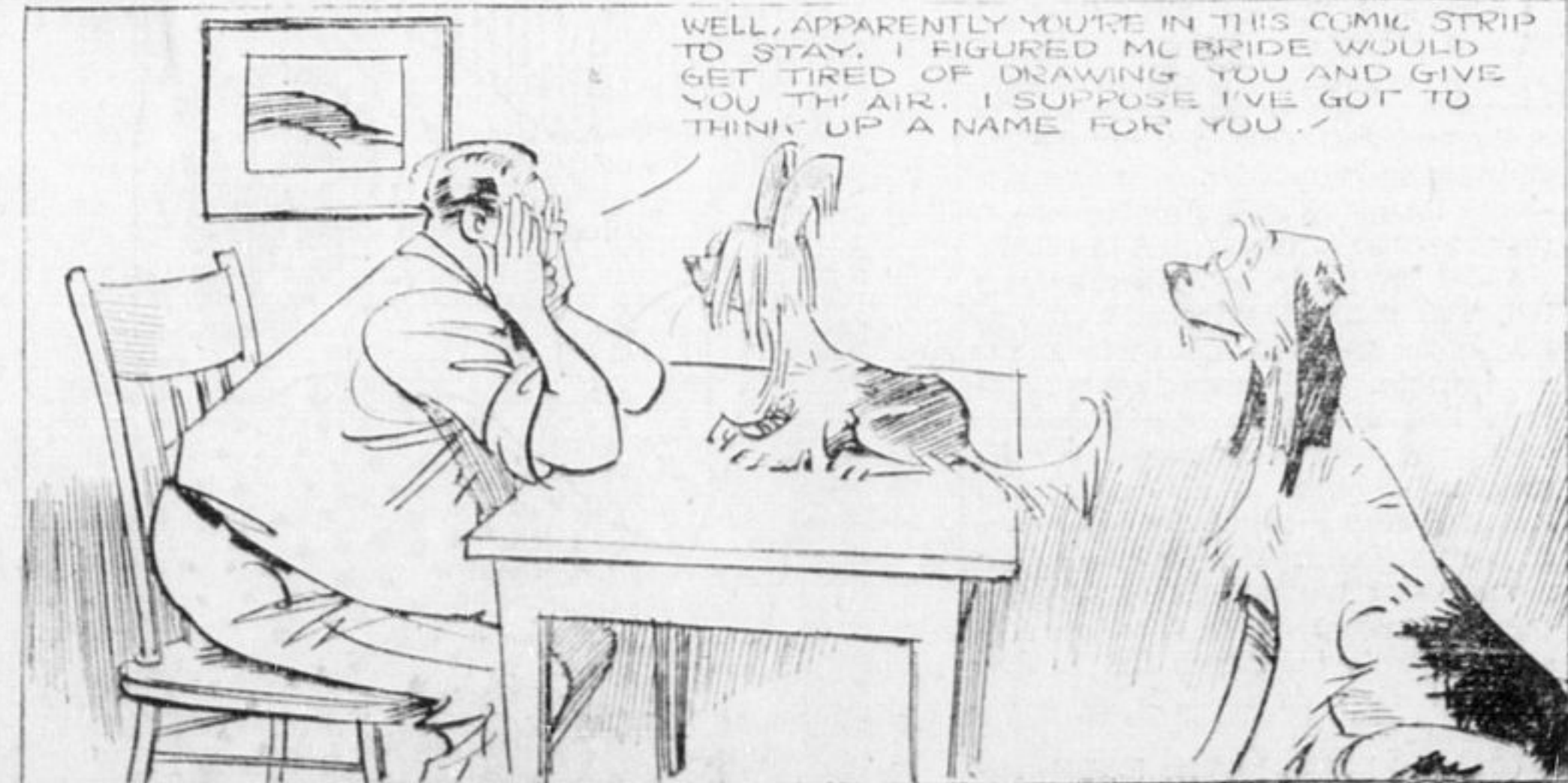
WELL, APPARENTLY YOU'RE IN THIS COMIC STRIP TO STAY. I FIGURED MR BRIDE WOULD GET TIRED OF DRAWING YOU AND GIVE YOU THE AIR. I SUPPOSE I'VE GOT TO THINK UP A NAME FOR YOU.

Sudbury Star—It looks less and less like war in Spain and more like playing a hose on the burning dump.