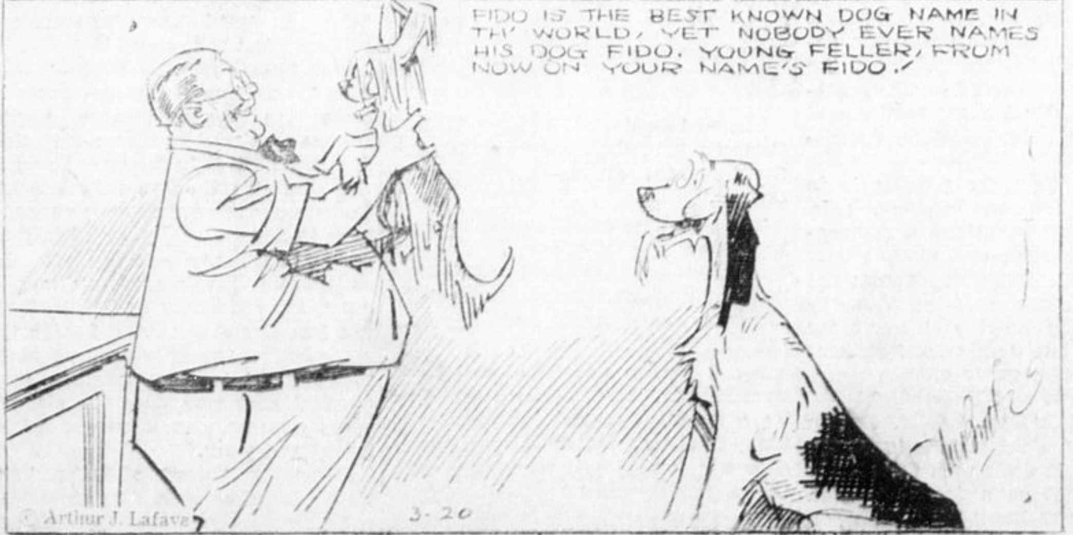
FIDO IS THE BEST KNOWN DOG NAME IN THE WORLD. YET NOBODY EVER NAMES HIS DOG FIDO. YOUNG FELLER, FROM NOW ON YOUR NAME'S FIDO.