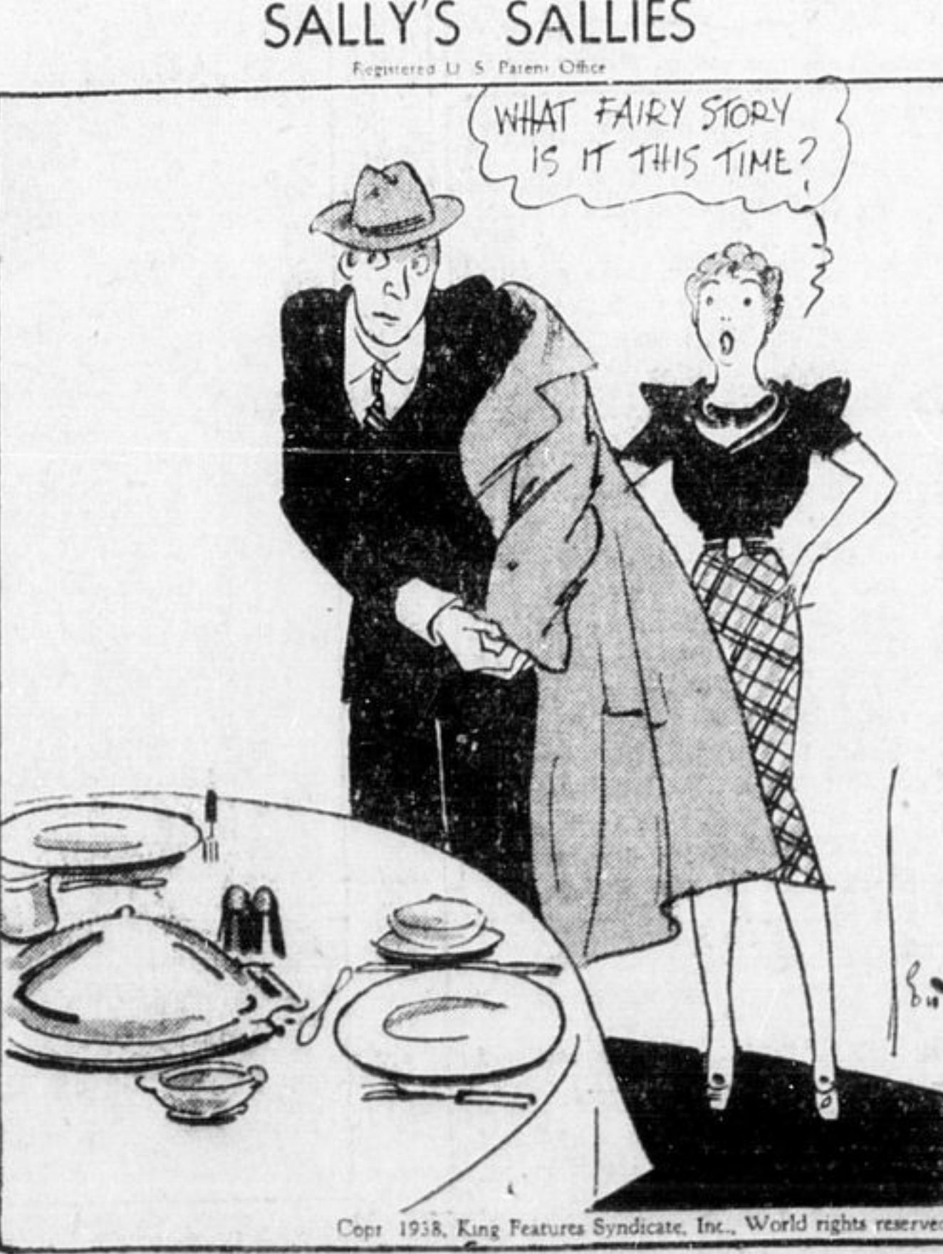
A woman who arrives late has a reason, but a man—he has an argument!

WE STAND FOR Repeal of Ontario Assessment Act to permit Taxation of Mines Property. A Conscientious Administration of Your Affairs OUR MOTTO — JUSTICE FOR ALL