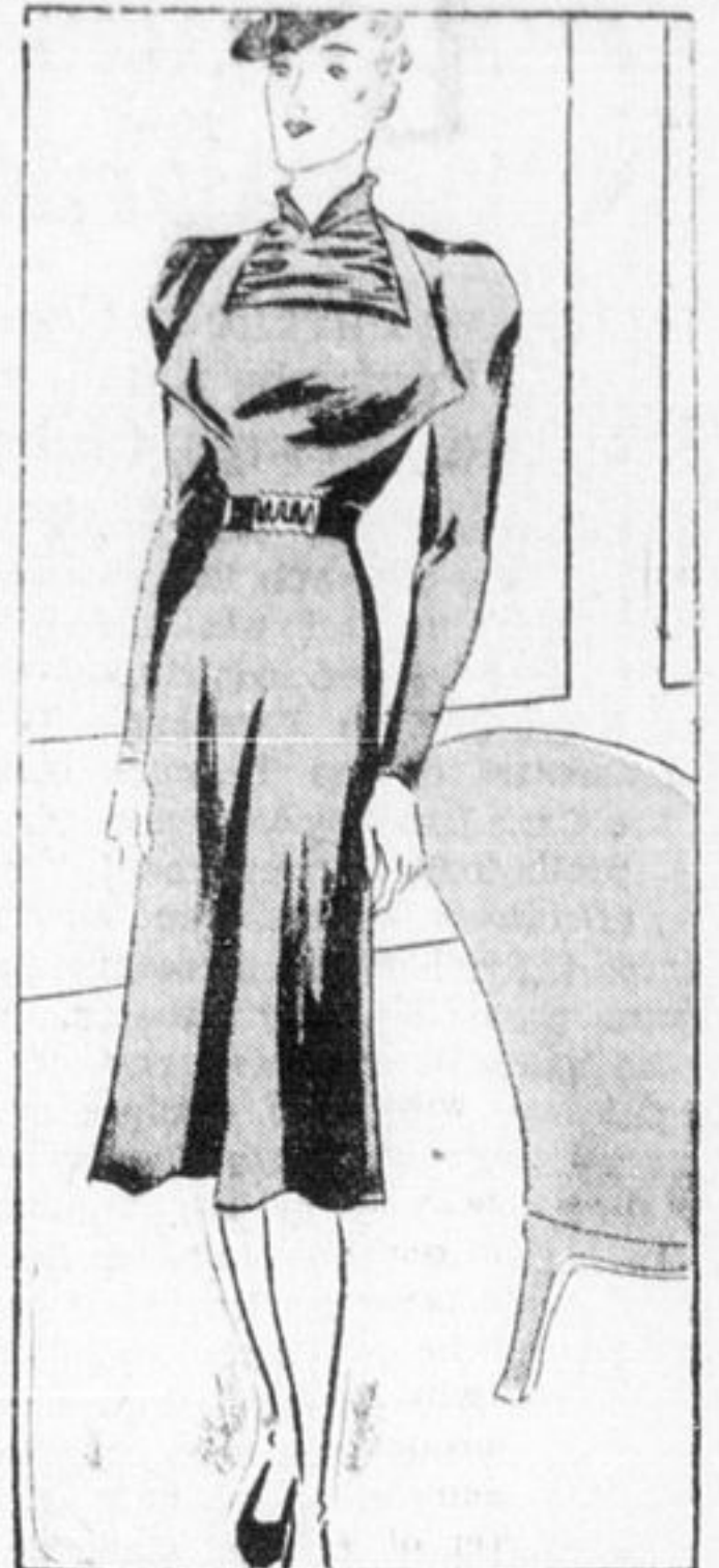
Emphasis At the Neck