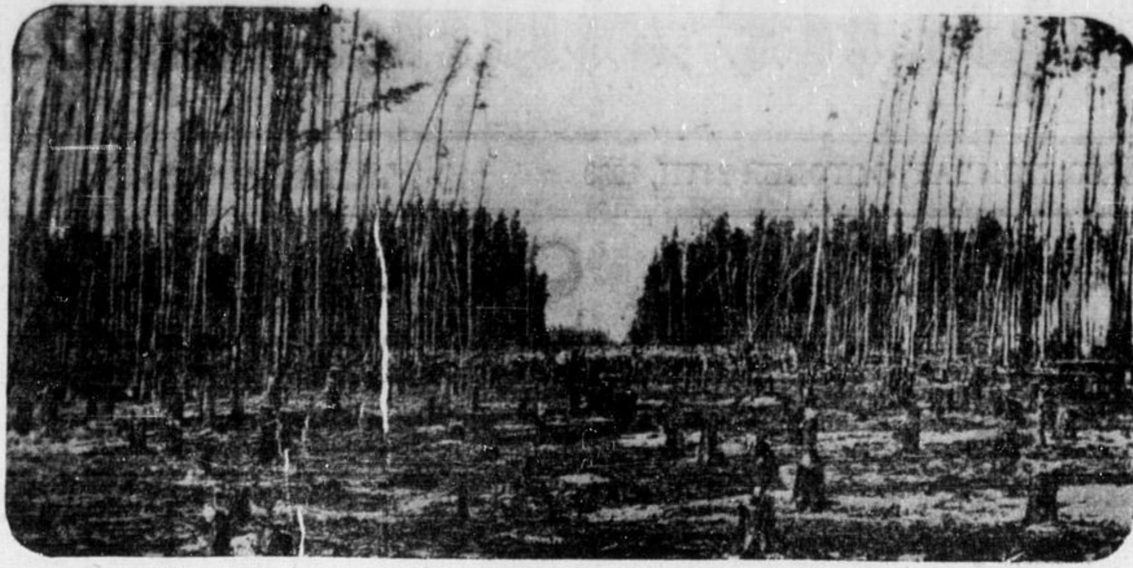
This is a scene taken 27 years ago where the city of Timmins now stands—and moves onward day by day. Contrasting the modern city of to-day with this partial clearing in the bush, Timmins may well use the boys' phrase, "You ought to see me now."