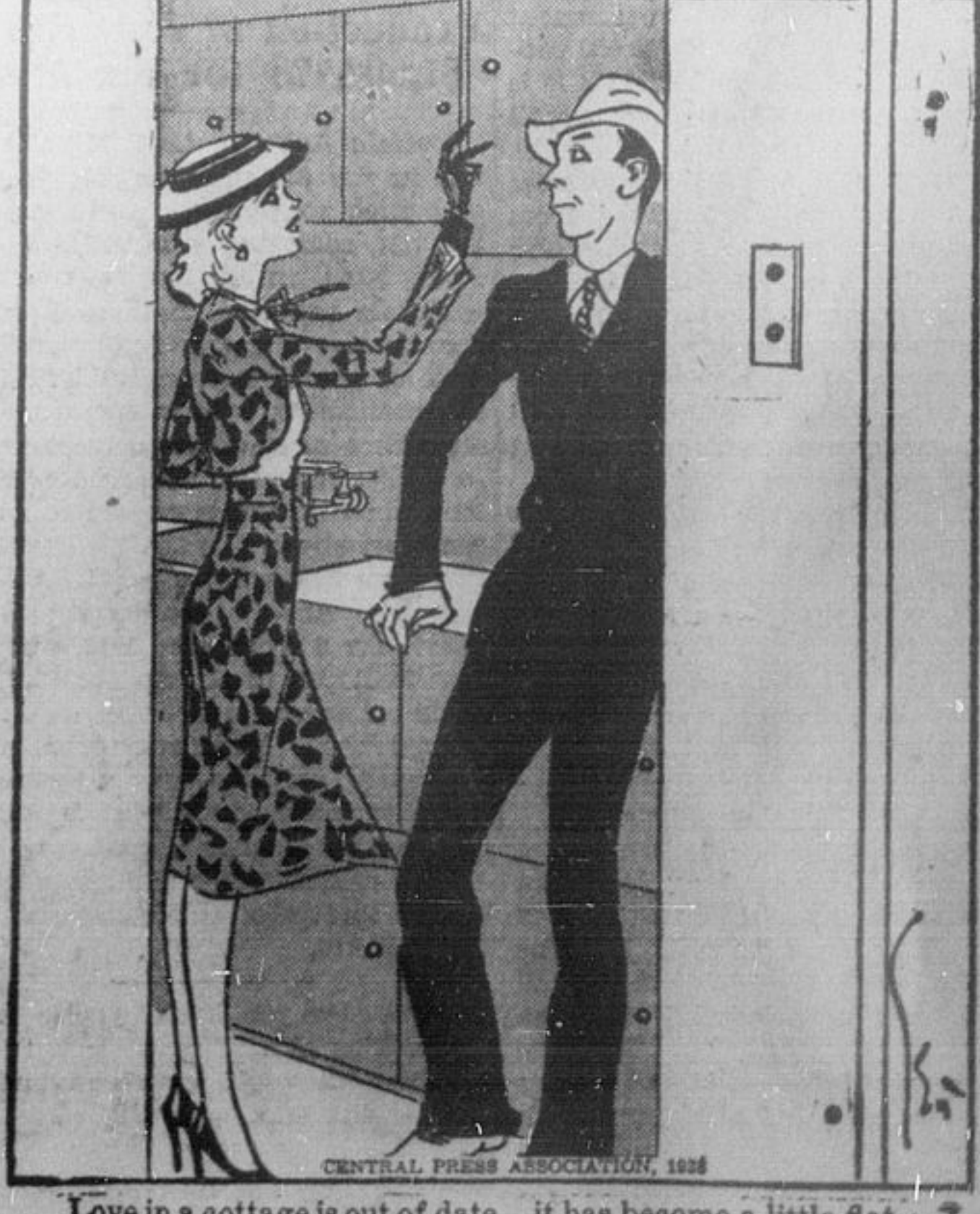
Love in a cottage is out of date—it has become a little flat.