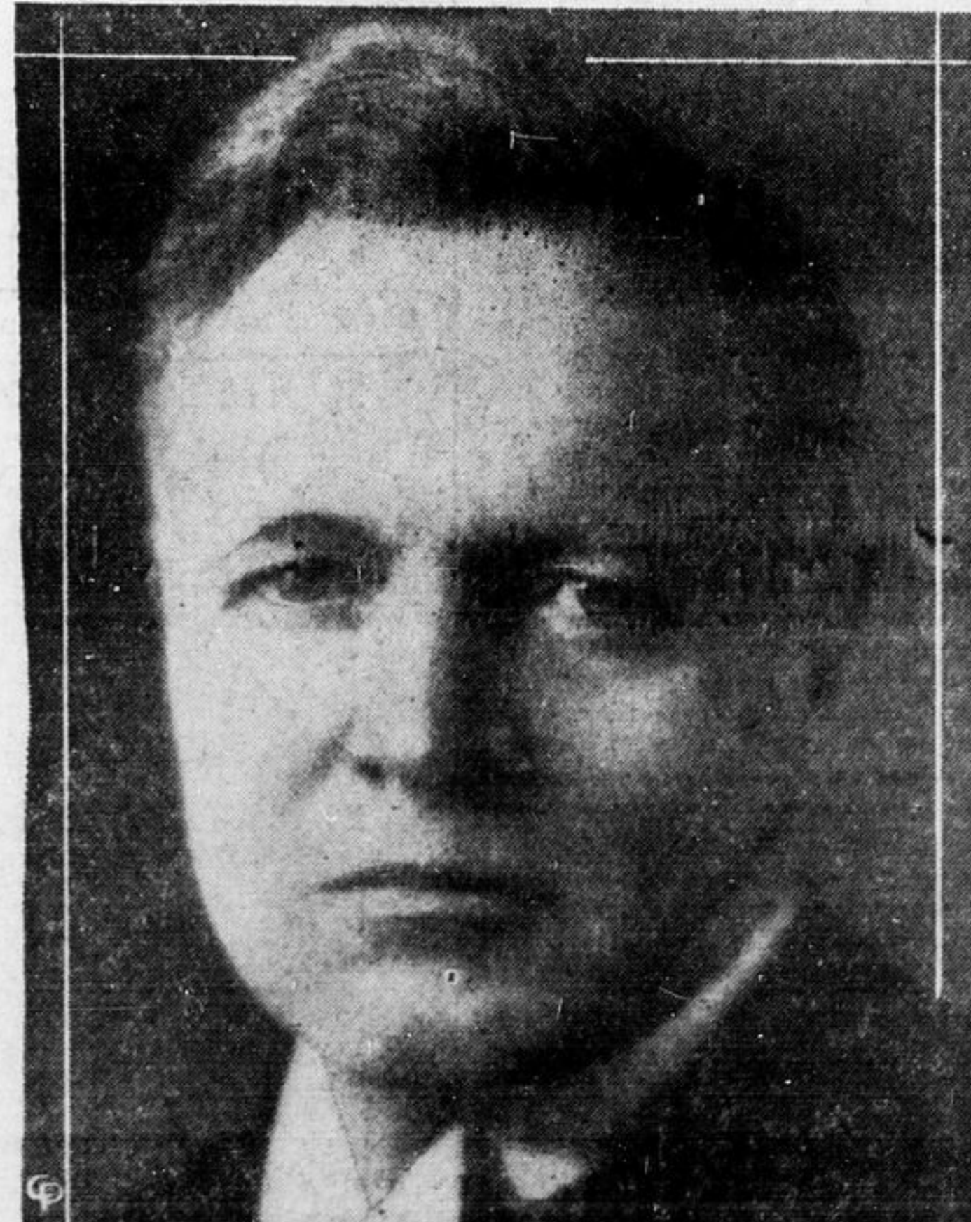
DR. R. J. MANION

At the national convention of the Conservative party, recently concluded in Ottawa, a new leader was elected in the person of Hon. Dr. R. J. Manion, ABOVE of Port William, Ontario. Dr. Manion succeeds Rt. Hon. R. B. Bennett to the party leadership.