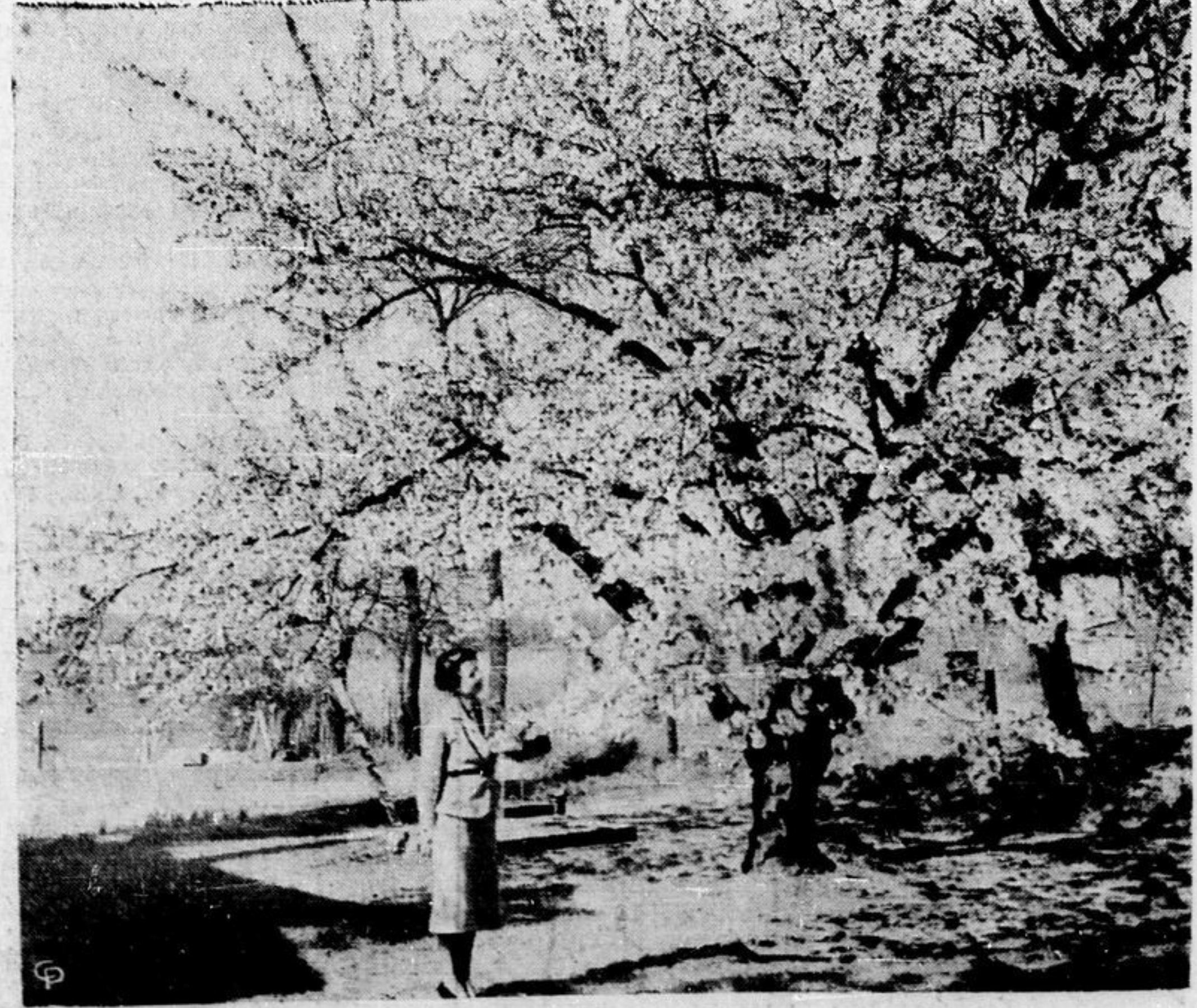
The Niagara peninsula presented a beautiful spectacle to thousands of visitors as millions of blossoms turned the Ontario fruit belt into a virtual fairy land of delicate colours. This young lady was photographed as she admired the blossoms near Grimsby, Ontario.