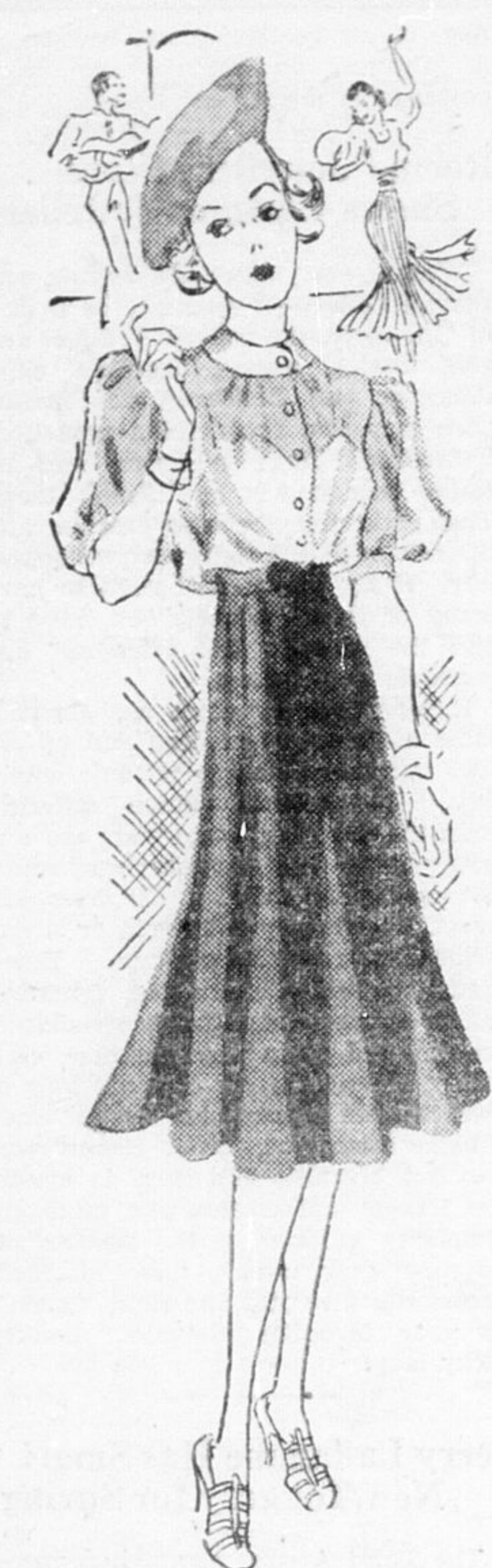
A full flared skirt, a printed vestee, and a dashing bolero jacket make this dress a dream come true.

For suits, the new colour of azure grey, has been one of the big sellers this year, particularly in the drape