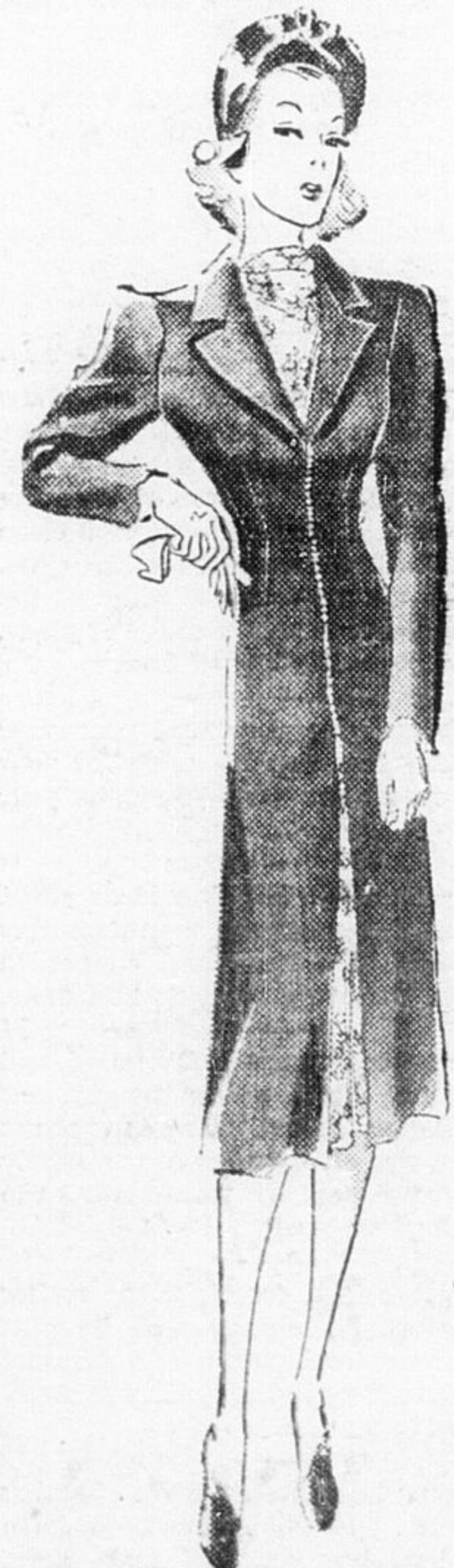
No wonder this young lady has passed before the camera. So would you, if you were wearing one of these new, "right-for-spring" zipper rendingotes with its gay print frock.

This year finds more glamour, natural attraction and fashion to the clothing the well dressed man will wear.