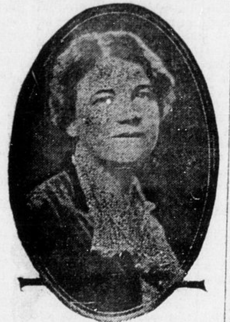
(By Edith M. Barber)

Probably no one is more interested in new food products than the busi-