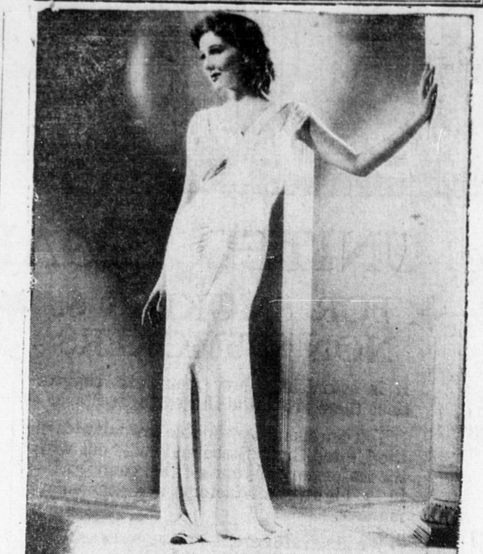
JEAN PARKER wearing an evening gown with the popular shirred waist and bodice. Heavy white silk fringe forms an interesting shoulder treatment.