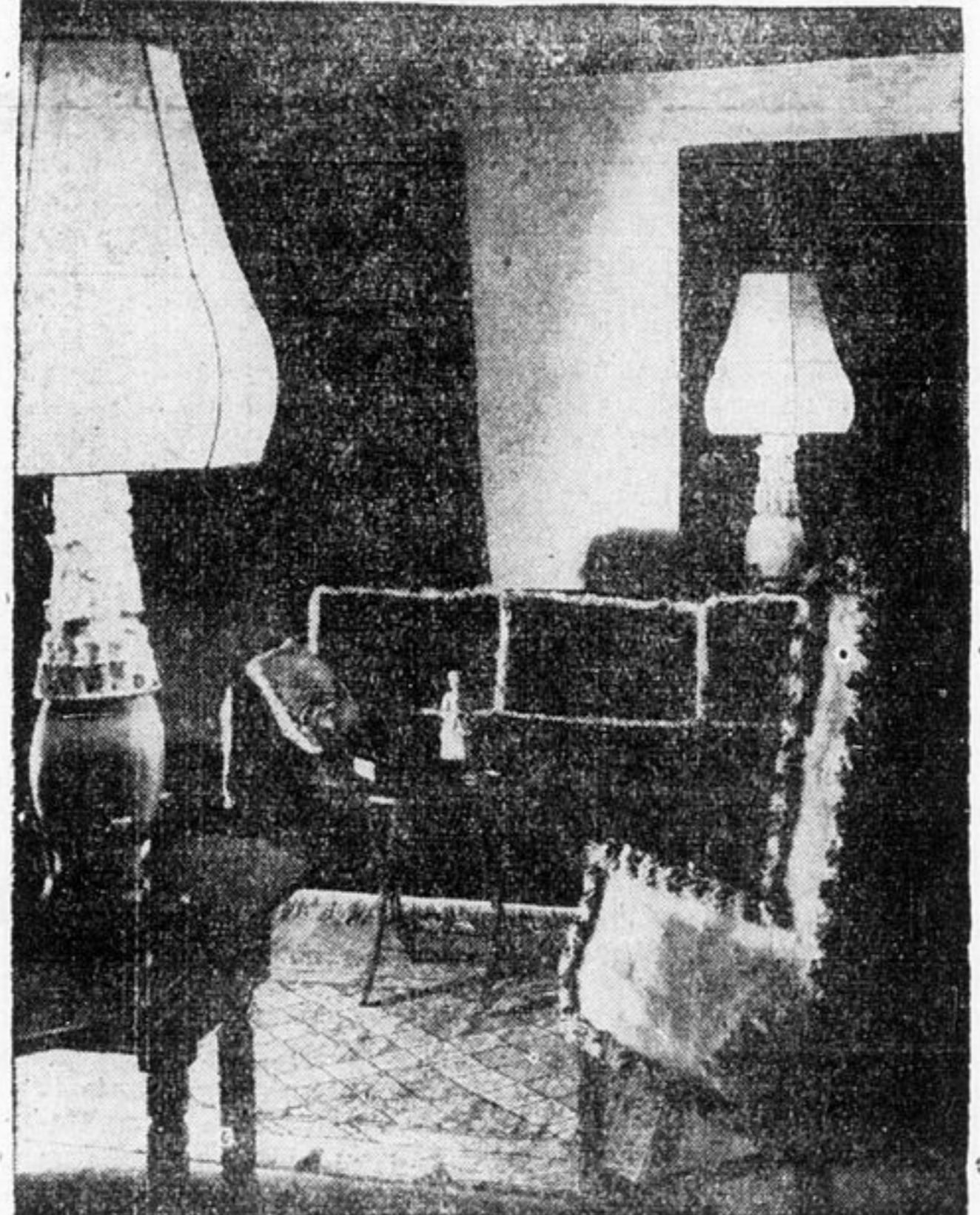
Dramatic indeed is this black velvet sofa with shaggy white fringe in the home of Forrest Knowles. The wing chair is in an off-white crushed plush with a green and white fringe welting. The room has off-white walls, gunmetal painted woodwork and ceilings, old but draperies and handsome off-white lamps.

room. And of course no big scale patterns. For the Underweights If your problem isn't overweight but underweight in your furniture, there is another bag of tricks for you. An important fabric, such as high lustre satin, dramatic velvet or a huge scale floral chintz... these are the things that make a small piece of furniture seem more important. And the bulky trimmings, wool or moss fringe, or even the Victorian rope fringe, add substance to an otherwise inconsequential piece. If the piece is too high and narrow for its own good, try a large scale floral on it and see how that lowers and widens it. If you have two chairs that should be a pair but aren't, cover them