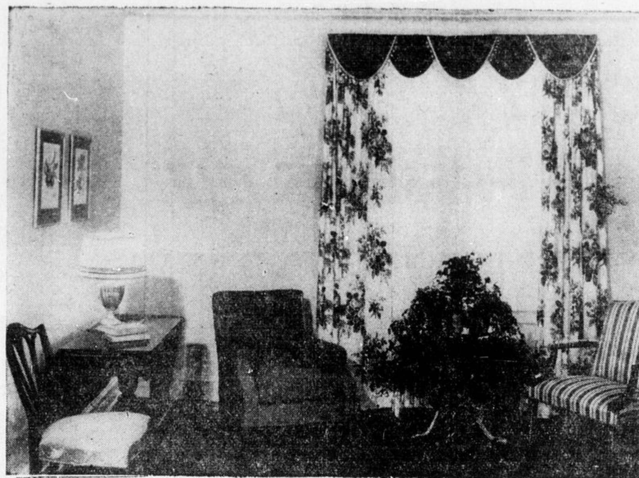
Chairs and tables of 18th century ancestry that suit the moderate sized rooms of today's living. This pleasant room has pale turquoise walls a plum carpet, plum valance and flower garden colours in the chintz with a preponderance of yellow. The plain chair is in a deeper turquoise, the striped one in yellow and plum and the side chair in yellow.

CONSIDER THE SIZE OF YOUR ROOM BEFORE DECIDING ON FURNITURE Contemporary Reproductions of Older Pieces of Furniture are Scaled to Meet the Needs of Smaller Rooms—Saving Space without Sacrificing Comfort.