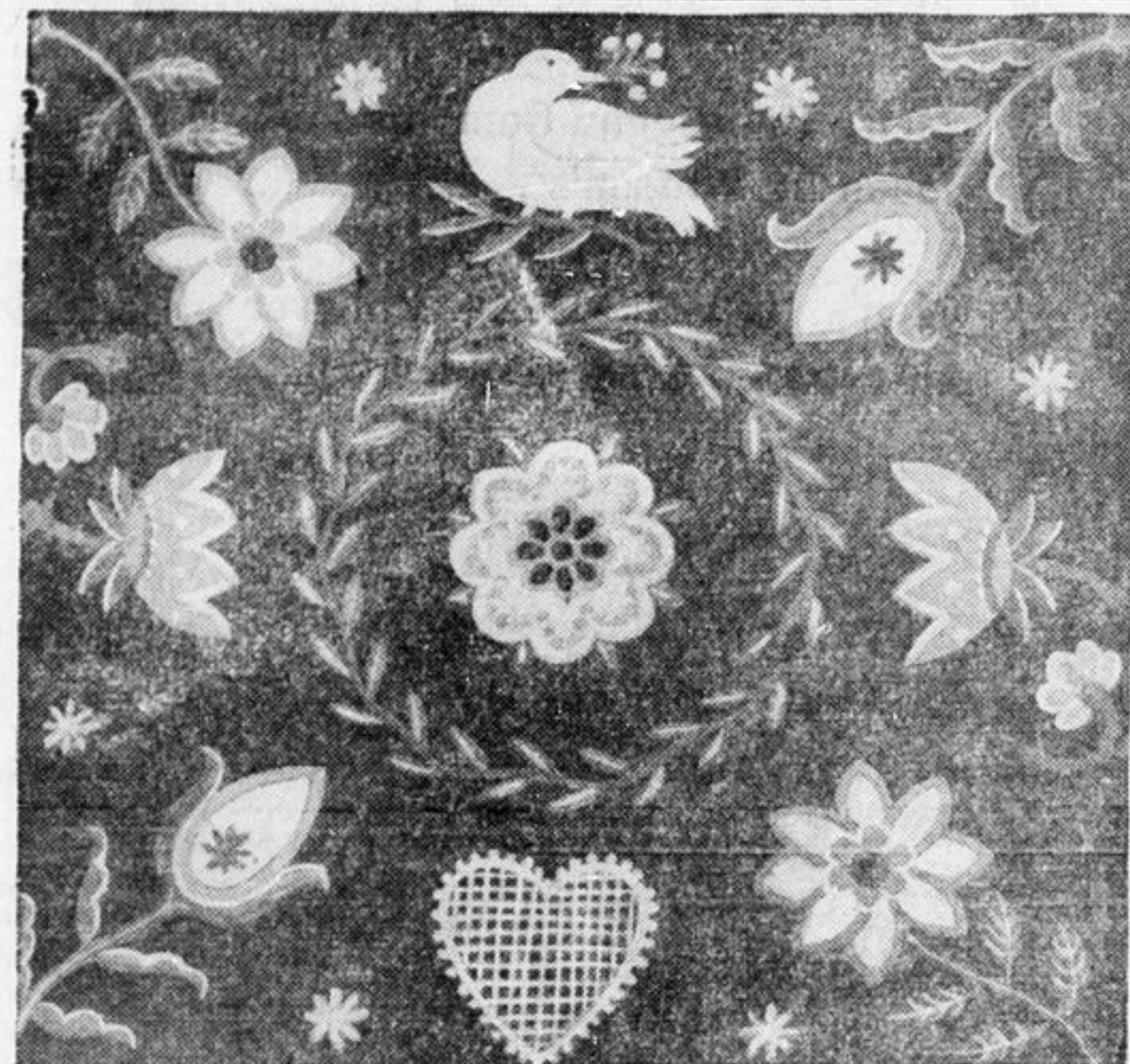
This is a new fall linen copied after a documented pattern prominent in Williamsburg restorations. Effective in blue and white.

We don't depend on the turning leaves or the Indian summer afternoons for our first whiff of autumn. Our harbingers of the new season are the fall fabrics: the rough tweeds, the drooping yards of velvets and the crisp widths of chintzes. Then there are always these first inklings of new design trends that are so fascinating to follow in decorative fabrics and so prophetic of the changing season whatever the weather.