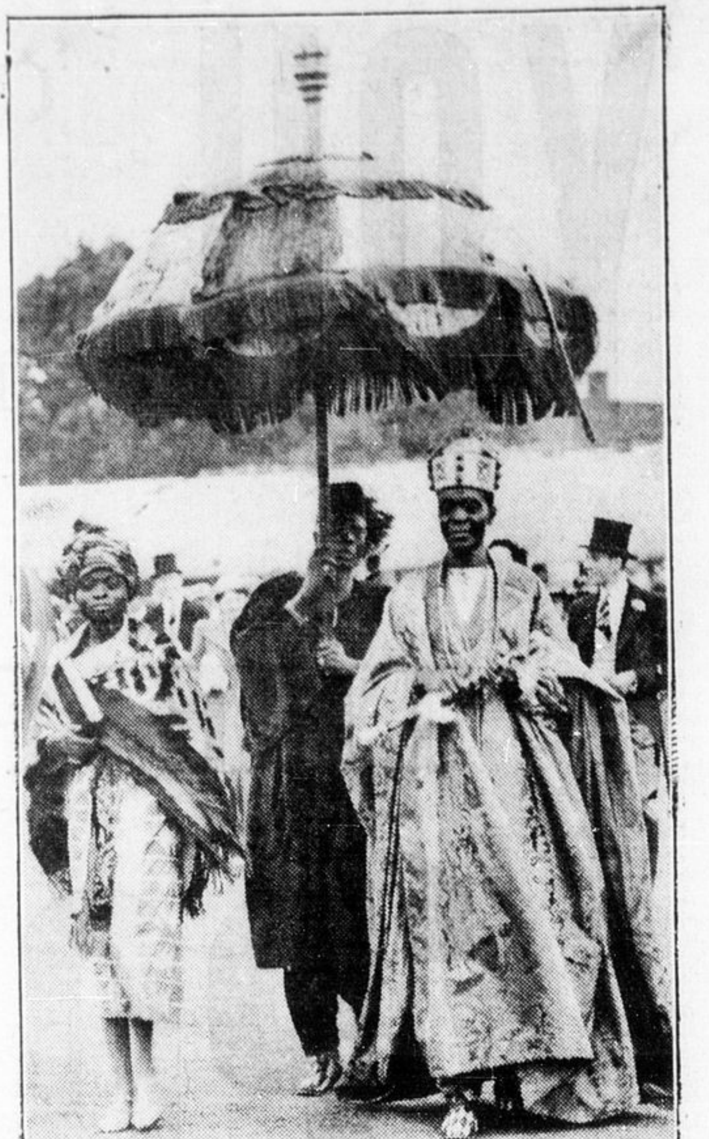
Spectators at Lord’s when Elton defeated Harrow saw an unusual sight when the Alake of Abeokutta paraded among the crowds. He is shown here with his attendants.