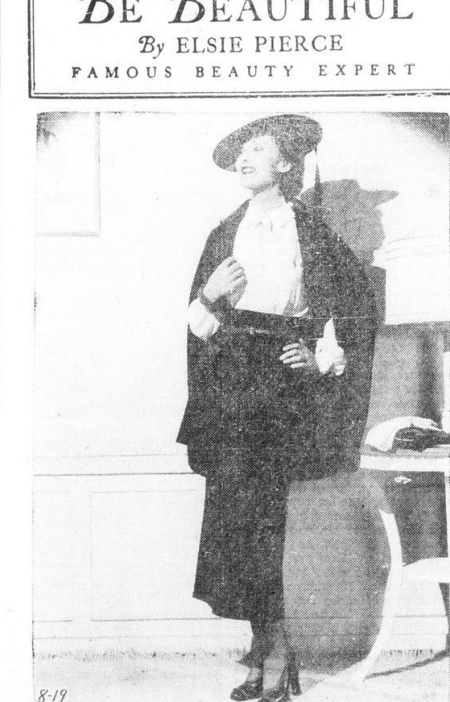
ANITA COLBY brushes her coiffure to the left side where its beauty is revealed by a new fall sailor deeply tilted to the right.

8-19 ANITA COLBY brushes her coiffure to the left side where its beauty is revealed by a new fall sailor deeply tilted to the right.