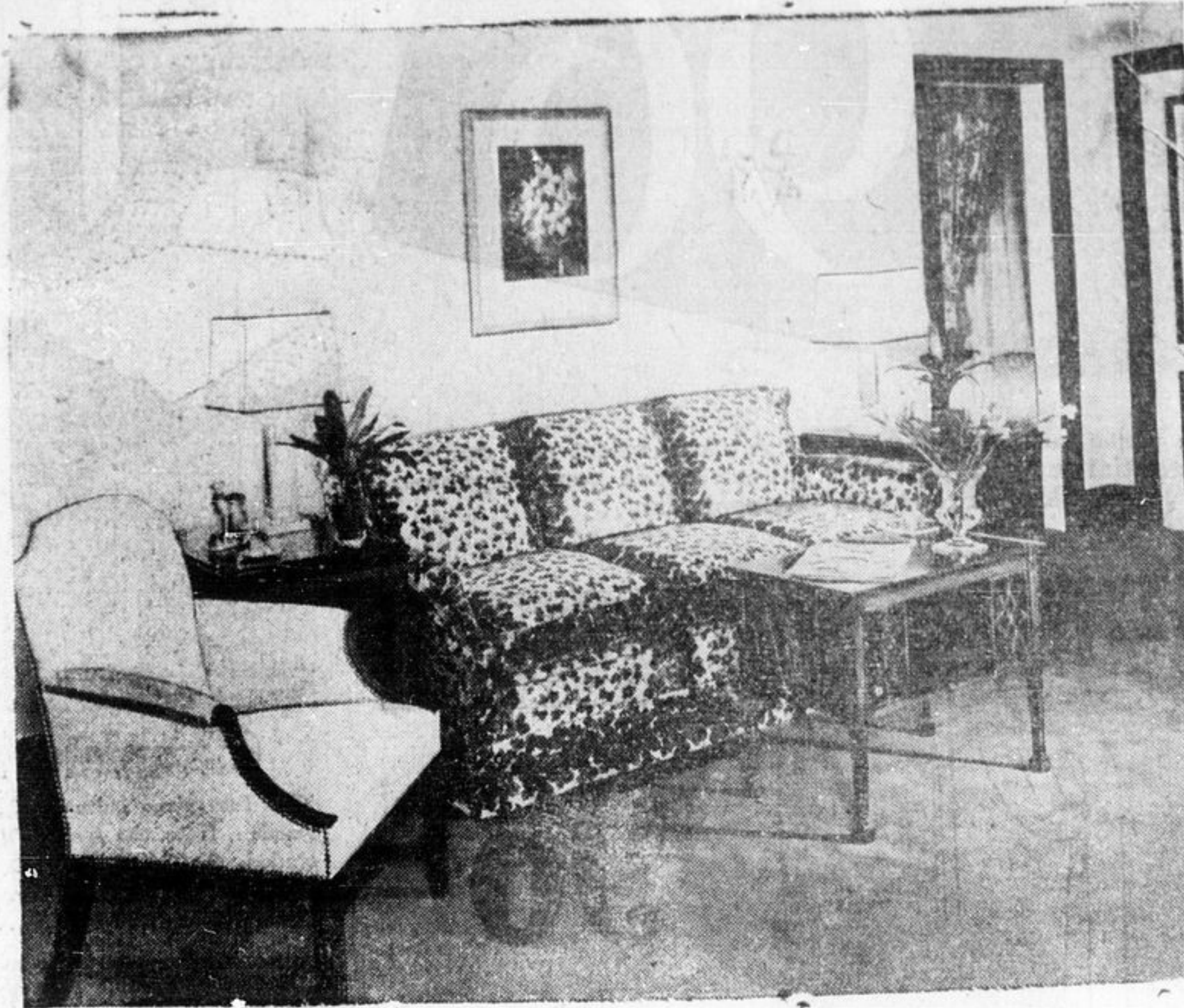
A pair of tables to flank the sofa will conveniently hold lamps and oddments, while a low table in front of the sofa is pleasant for magazines or books, cigarette things, refreshments or a vase of flowers. Here the colourings of the room are cafe au lait walls, one chair in cafe au lait damask and the sofa in a slip cover of cafe au lait ground with leaf green pattern. The rug is cocoa colour.

Today we're going to make a case for some of the not-quite necessities which we think add such a lot to the pleasure of every day living. Have you enough of them?