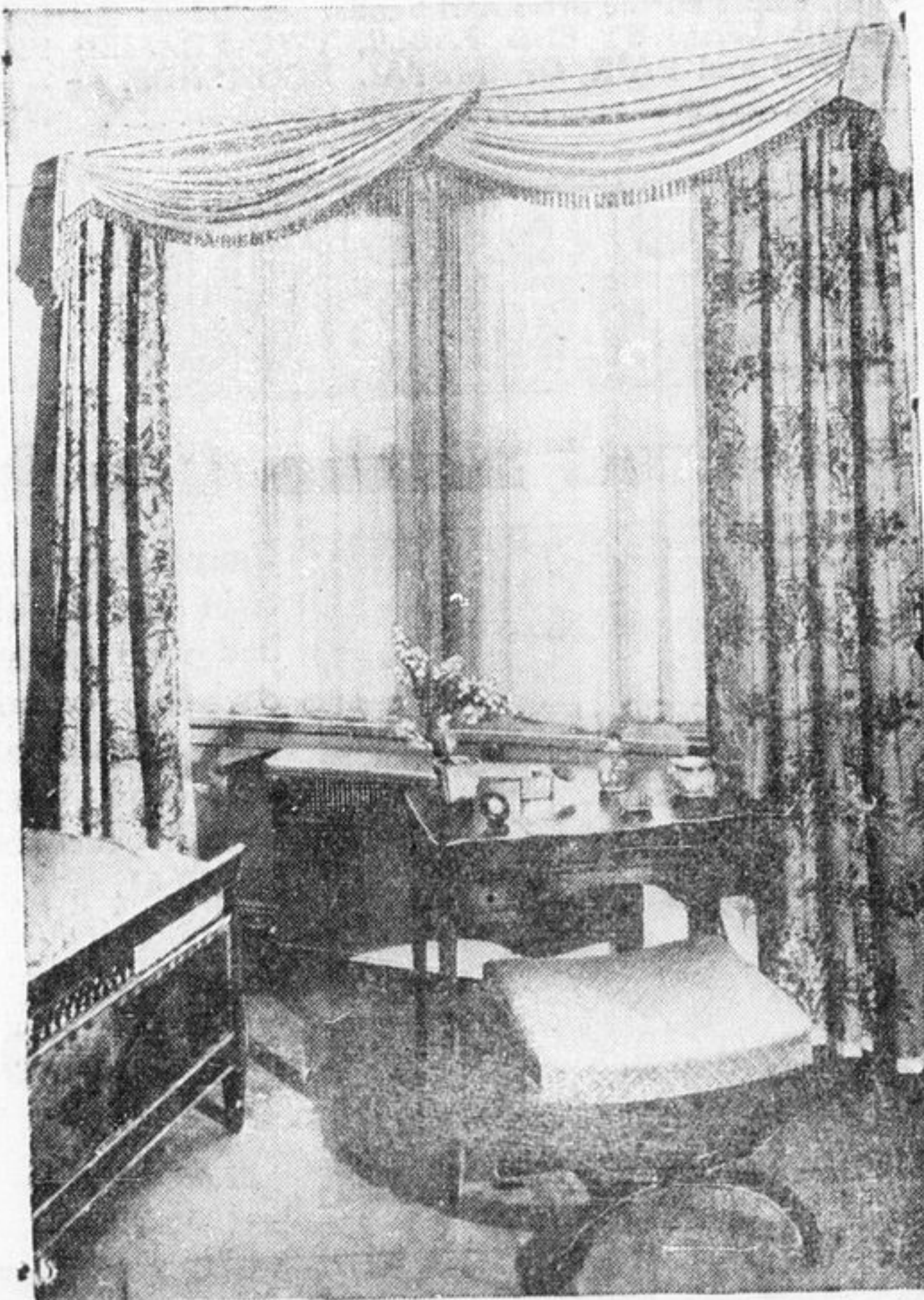
This little table is a poufouse.—the top opens up to reveal a lovely mirror and there is an inner compartment for make-up things. This is in the apartment of Helen Cleason, star of the Broadway hit "Frederika." Note the pleasant arrangement in front of the window. The colourings of this room are subtly interesting, the valance being pale beige faille with dusty rose ball fringe and the draperies are in chintz in predominant tones of dusty rose which repeat the colour of the walls. The rug is in an old blue.