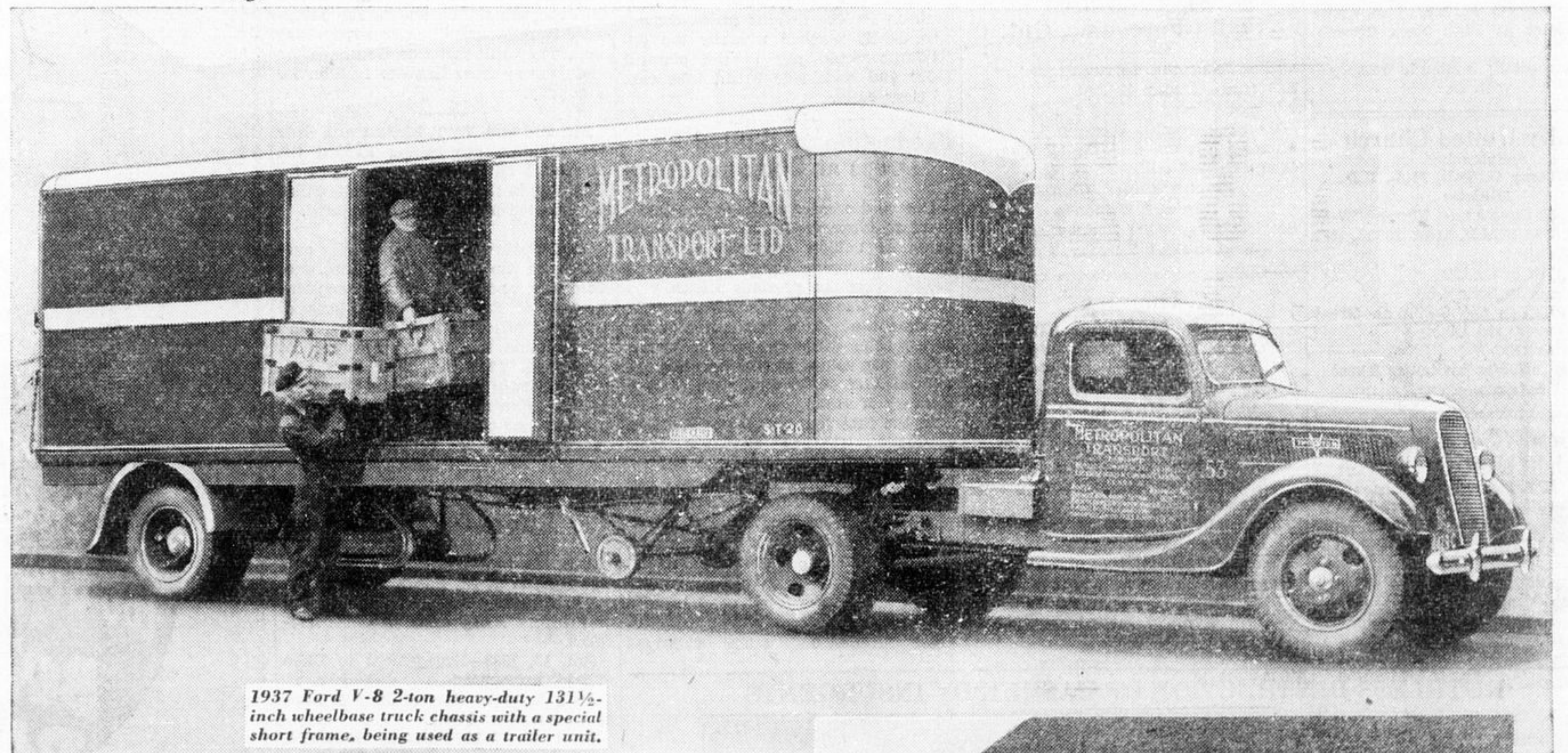
1937 Ford V-8 2-ton heavy-duty 131 1/2-inch wheelbase truck chassis with a special short frame, being used as a trailer unit.

YOU want power to haul your heavy loads on the steep grades and on the level highway... power to give the performance needed for modern trucking. You want ruggedness in every vital part of your truck to keep it on the job and maintain performance at the peak. All 1937 Ford V-8 2-ton and 1 1/2-ton trucks and commercial models have the ruggedness that heavy loads and fast schedules call for. And they are powered to do your individual job with economy. The 2-ton truck has a 95-horsepower V-8 engine. The 1 1/2-ton truck has an 85-horsepower V-8 engine. Commercial models have choice of an 85-horsepower or a new 60-horsepower V-8 power-plant. As well as this specialized power, the Ford V-8 line provides a choice of wheelbases, truck axle gear ratios, a range of body types, tire sizes and special equipment to give you the exact unit that fits your business. There, in a nutshell, is the basis of Ford Specialized Transportation. Call your Ford dealer today and set a date for an "on-the-job" test — with your own loads, under your own operating conditions. It costs nothing — get the facts.