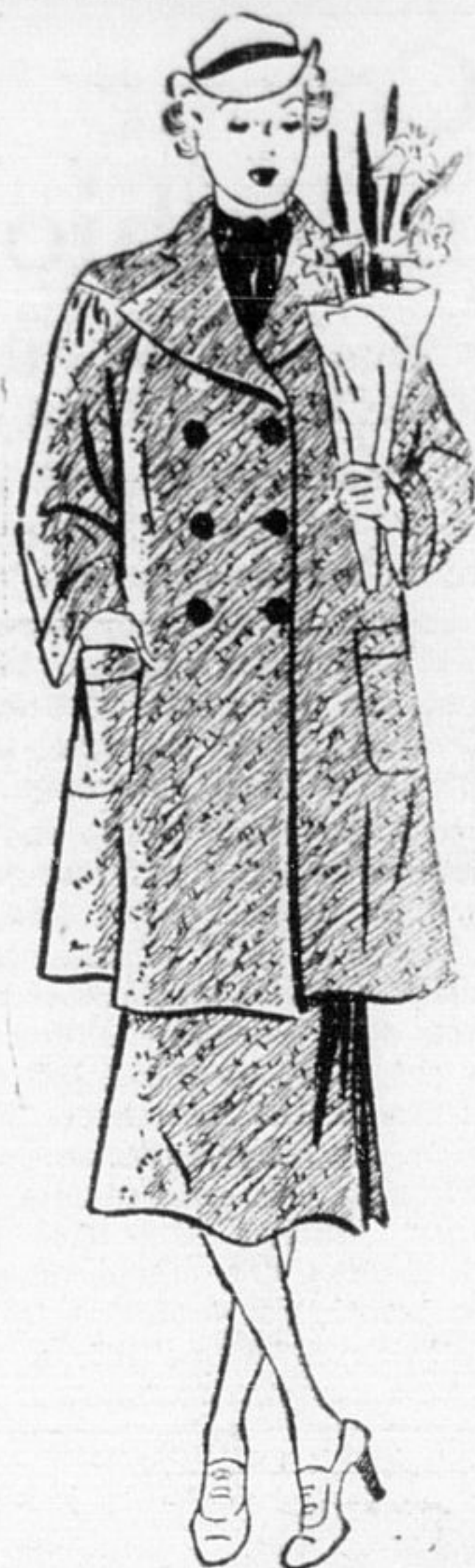
For the 'teen age miss, that casual swagger smartness, as shown in this tweed full back suit.

A simple blouse or dress cut on classic lines, which can be made to look informal or dressy as the occasion demands, is a versatile addition to anyone's wardrobe. Such dresses and blouses, cut on a line that has withstood the test for years, come with different kinds of studs for the front fastenings. These change the look of the costume completely. With sport crystals backed with pictures of dogs or horses, the informal scene is suggested. About jewelled cabochon or rhinestone studs, there is quite a formal air. Key-shaped studs are the newest addition to the collection. One may also have plain gold or silver studs with one's initials engraved on them. These dresses and blouses come in linens, solid-colour or printed silk crepes, cottons, silk herringbone, alpaca or fine-hair wool.