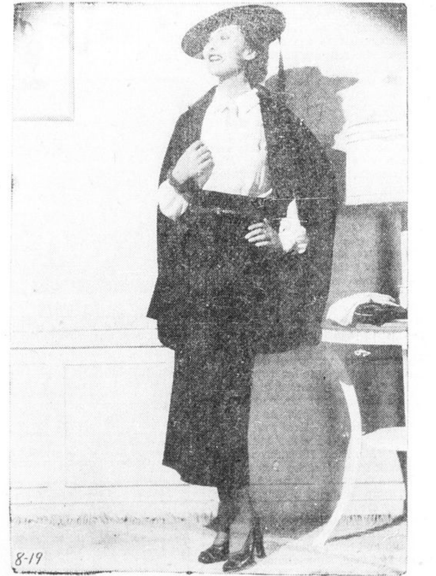
ANITA COLBY brushes her coiffure to the left side where its beauty is revealed by a new fall sailor deeply tilted to the right.