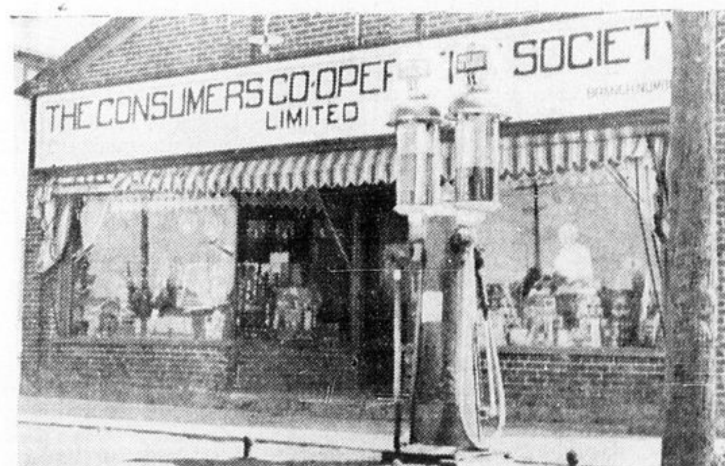
Above is a picture of the South Porcupine Store of the Consumers' Co-operative Society. The Society this week observed its fifth anniversary. The event was marked by a concert at South Porcupine on Tuesday night. The Society also has stores at Timmins and Schumacher.